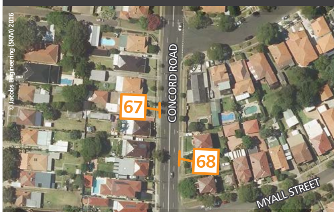
CONCORD ROAD AND MYALL STREET, RHODES