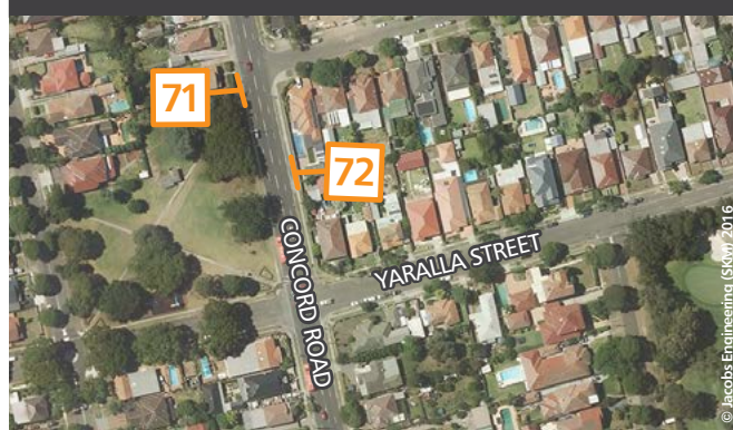
CONCORD ROAD AND YARALLA STREET, CONCORD WEST