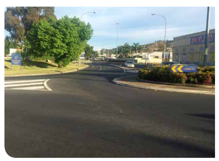
Planning is underway to upgrade the Jewry Street intersection on Manilla Road (Peel Street)

The 2017-18 State Budget included $150,000 to develop plans to upgrade the Jewry Street intersection on Manilla Road. Planning is progressing for this project, including surveying, traffic modelling and other investigations.