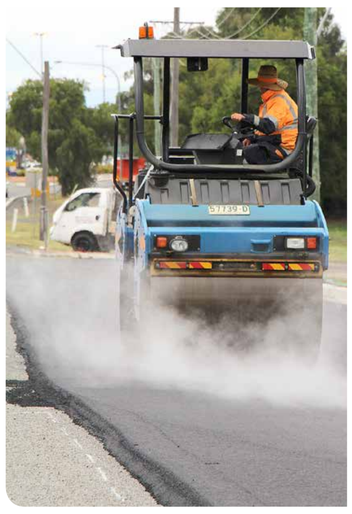
Final seal going on for the first stage of the Manilla Road upgrade

Please note there will be no formal presentations given, so community members can visit at any time during the session.