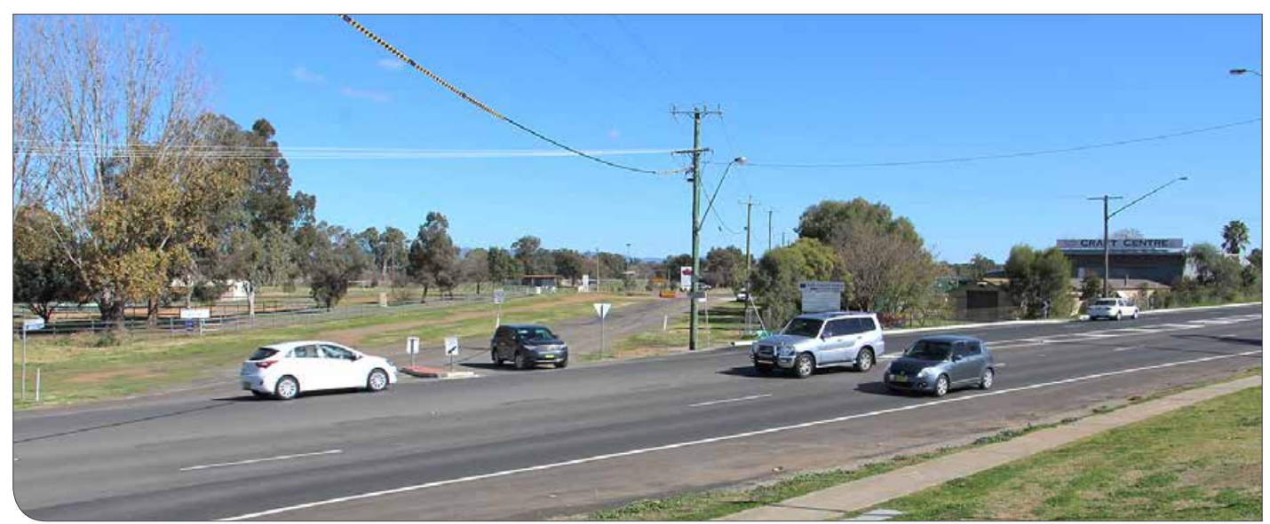
The Marius Street intersection on Manilla Road

The NSW Government is providing $3.5 million to fund the next stage of the Manilla Road upgrade between Tribe and Jewry streets, North Tamworth. This stage of the work will involve building a new roundabout at the Marius Street intersection.