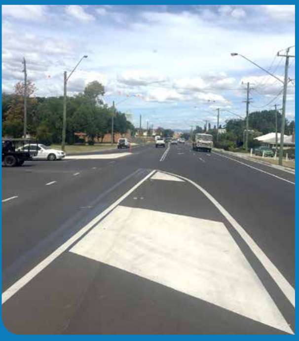
Tribe Street intersection where we extended the right turning lane into Tribe Street, built a new slip lane onto Manilla Road from Tribe Street and resurfaced Manilla Road.