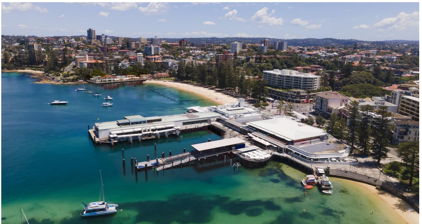
Artist impression of proposed works at Manly Cove

Following community feedback on the concept design earlier this year, we have updated the design and prepared a Review of Environmental Factors (REF). We invite the community to provide feedback on the REF by Friday 23 December 2022 .