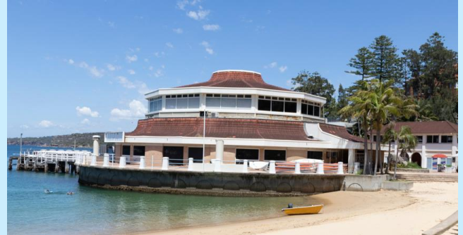
View of the former Sea Life building where signs will be installed around the ground floor

Transport recognises the importance of creating a place, which respects the local cultural heritage, connects people to land and water and creates a prominent waterfront location in Manly.