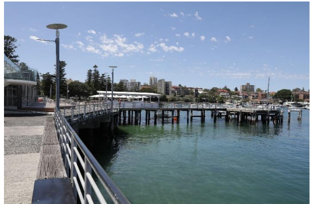
View of the existing Manly Wharf 3

The new design will provide improved customer amenities, and improved accessibility for all customers using the wharf including those with assisted and unassisted mobility needs.