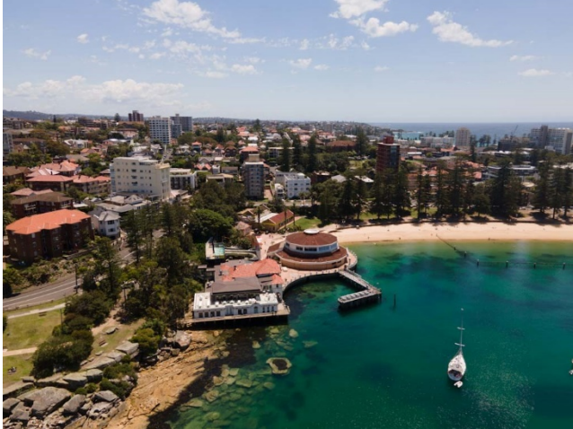
Aerial view of the Manly former Sea Life building

We recognise the importance of creating a vibrant place in Manly Cove, which respects the local cultural heritage, connects people to land and water and supports recreation and enjoyment of this prominent waterfront location.