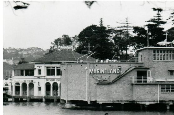
Historical Photo of Marineland