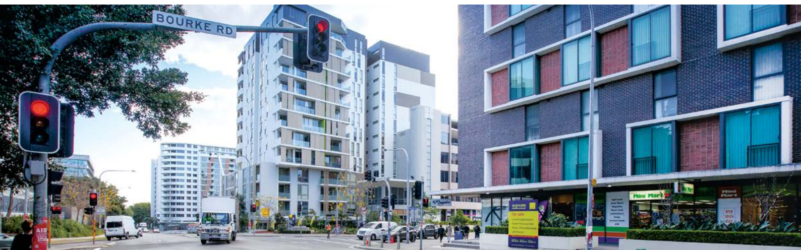
Mascot intersection upgrades at Coward Street and Bourke Road to begin in September 2019

Roads and Maritime Services | September 2019