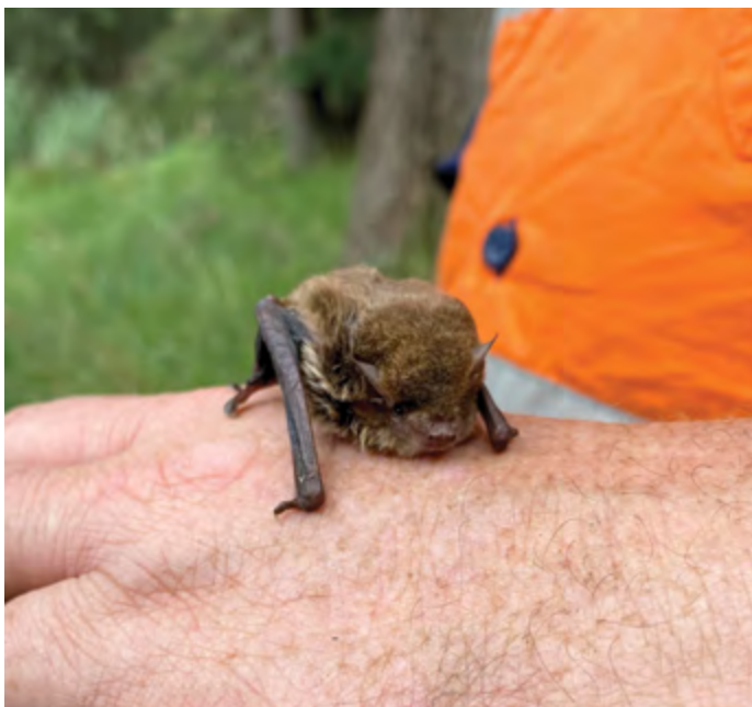
One of the microbats that was discovered and relocated during the project

In May 2021 whilst working on the project TfNSW workers made a surprising discovery: a colony of endangered southern myotis microbats. Work stopped immediately to enable WIRES and a specialist ecologist to establish the extent of the colony and ensure the bats were safe. When the bridge upgrade is completed, purpose-made bat habitat boxes installed during the project will be relocated to allow the bats to remain in the area.