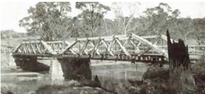
McKanes Falls Bridge, pictured here in 1950, is a key feature in the heritage landscape of the Lithgow area

The McKanes Bridge is expected to be open to traffic by September 2022, weather permitting. Transport for NSW is sincerely grateful for the patience and ongoing cooperation of residents and the South Bowenfels community while we complete this important project.