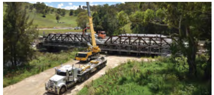
Construction on McKanes Bridge in February 2022