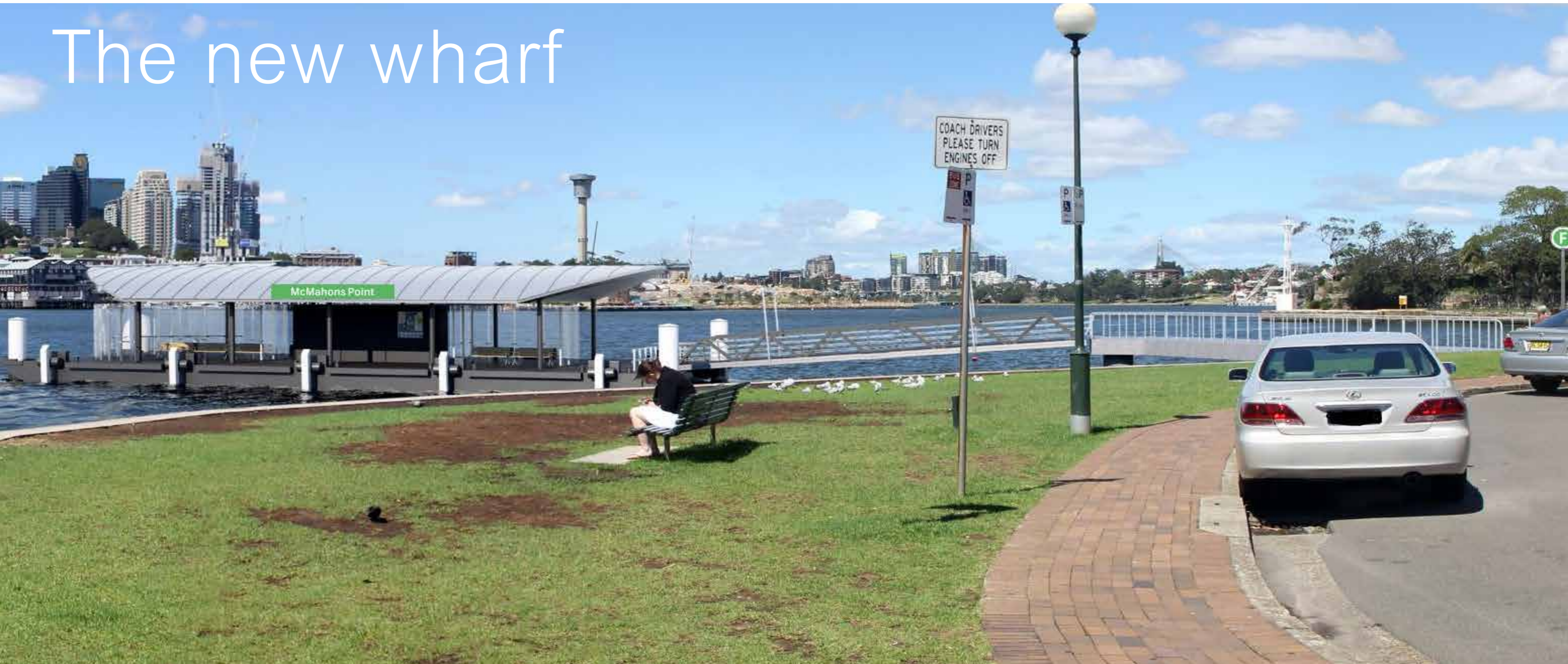
Artist's impression of the new McMahon's Point Wharf viewed from Henry Lawson Avenue.

The existing wharf will be replaced by a completely new structure in a new location. The new wharf is designed to provide customers with improved access and amenity.