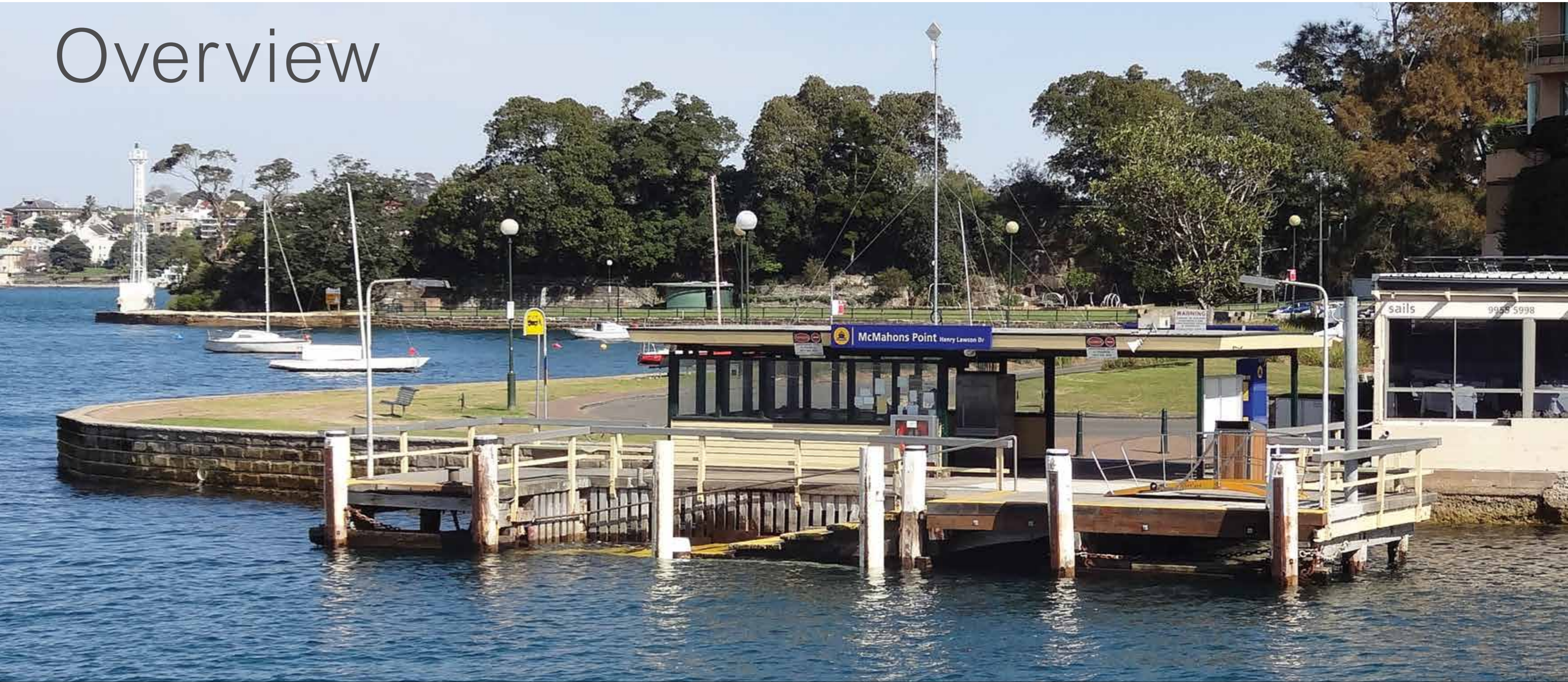
Existing McMahon's Point Wharf.

The NSW Government is upgrading McMahon's Point Wharf. The new facility will improve safety and amenity for customers.