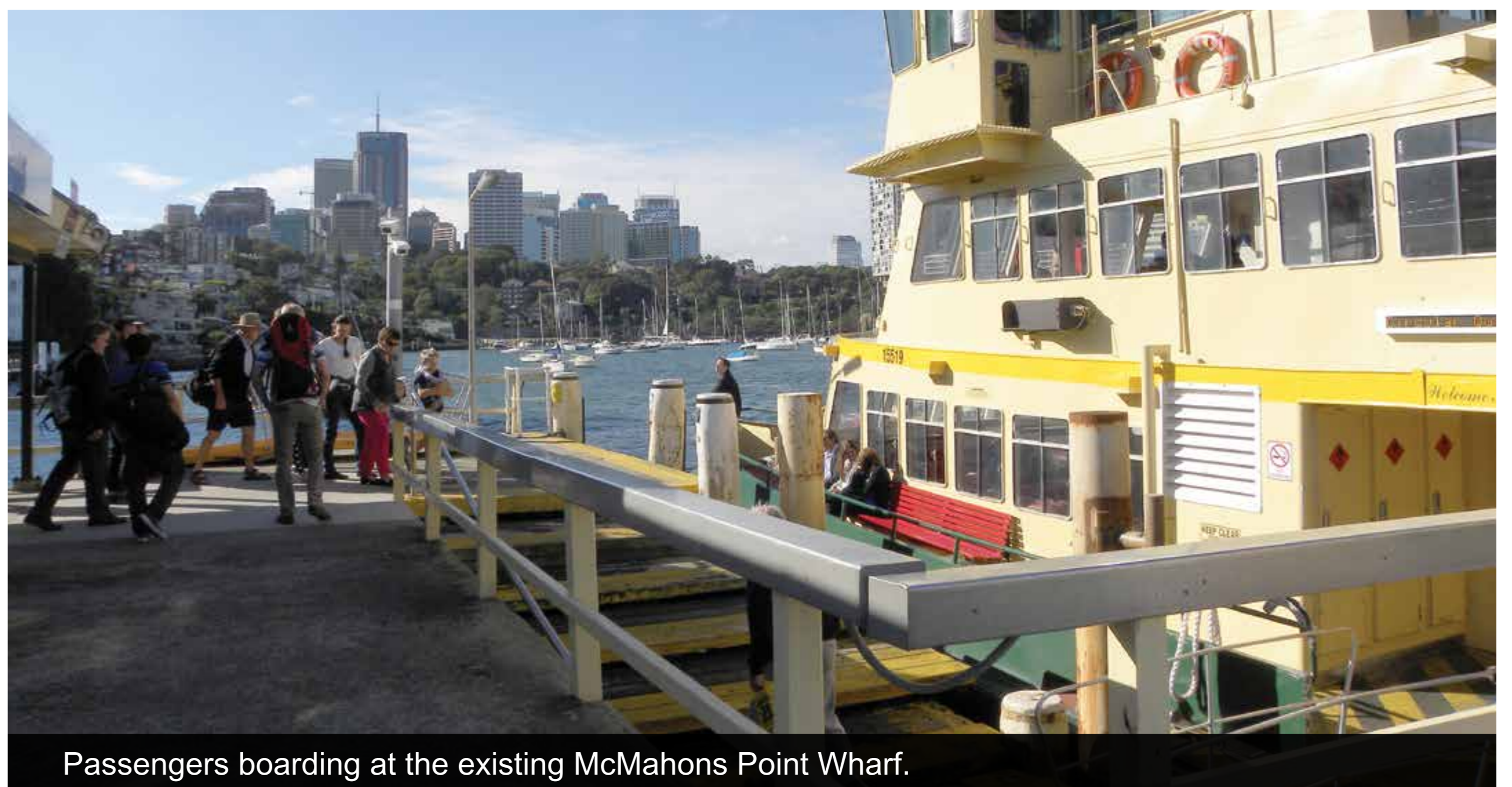
Passengers boarding at the existing McMahon's Point Wharf.