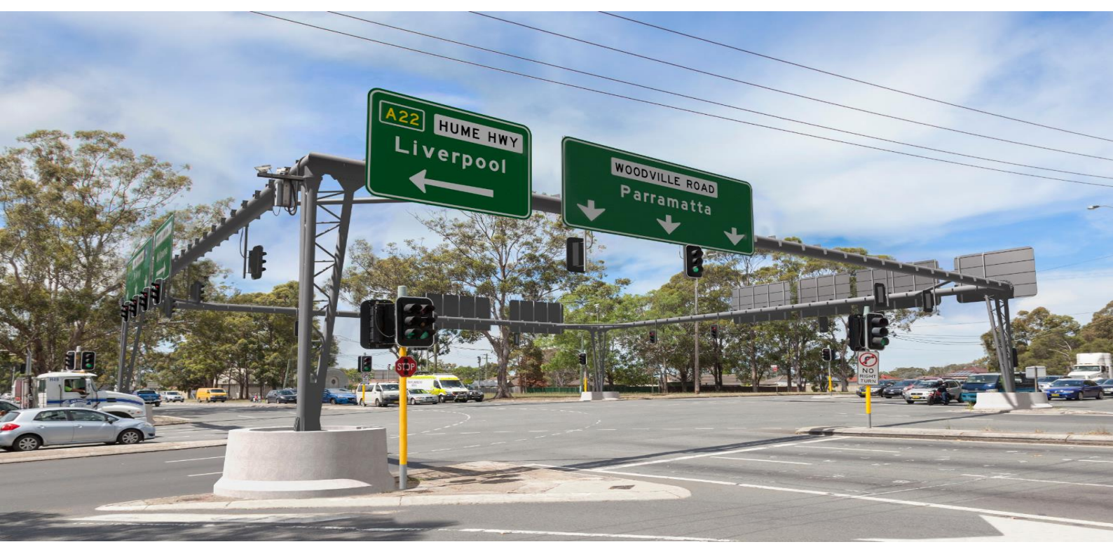
Artist's impression of the new Meccano Set on the Hume Highway at Lansdowne

The NSW Government is delivering this project to replace the iconic Hume Highway 'Meccano Set' under the NSW Government's $1.5 billion maintenance program.