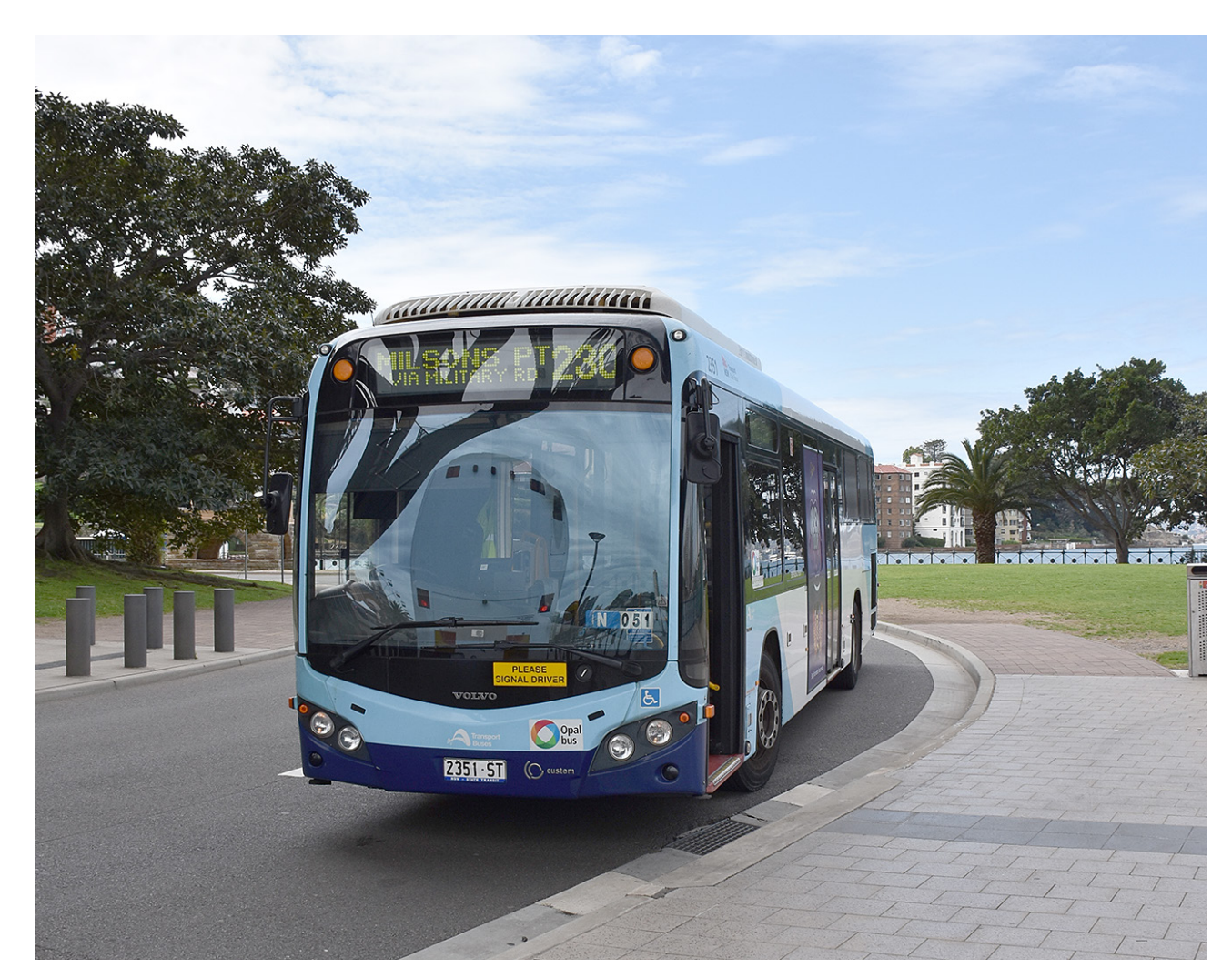
Bus approaching Milsons Point Wharf

Transport for NSW will provide up to date information about any temporary changes to the timetable during work to expand Milsons Point Wharf. You will be able to plan your trip using the trip planner at transportnsw.info or call Transport Info on 131 500 .