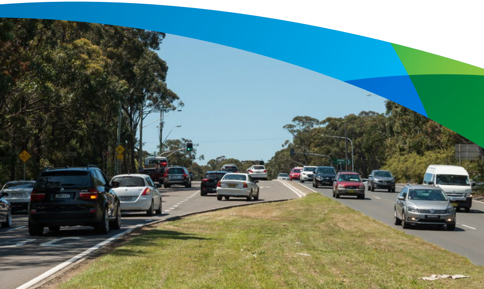
Intersection of Mona Vale Road and Forest Way