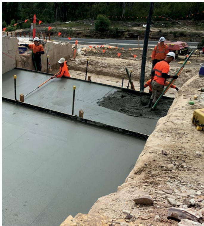
Construction has commenced of fauna bridge west of Lane Cove Road

Out of hours work may happen between 8pm and 5am with up to three shifts per week, weather permitting. We will not work more than two consecutive nights in the same area. We will advise you before we start night work near your property.