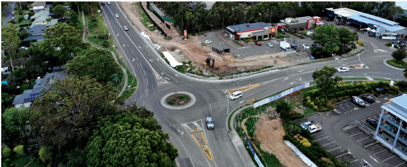
Intersection upgrade work continues at the Samuel Street, Ponderosa Parade and Mona Vale Road roundabout

The NSW Government is upgrading Mona Vale Road from two to four lanes between Terrey Hills and Mona Vale. The upgrade is being carried out in two stages to provide customers with a better travelling experience and to improve safety and traffic flow.