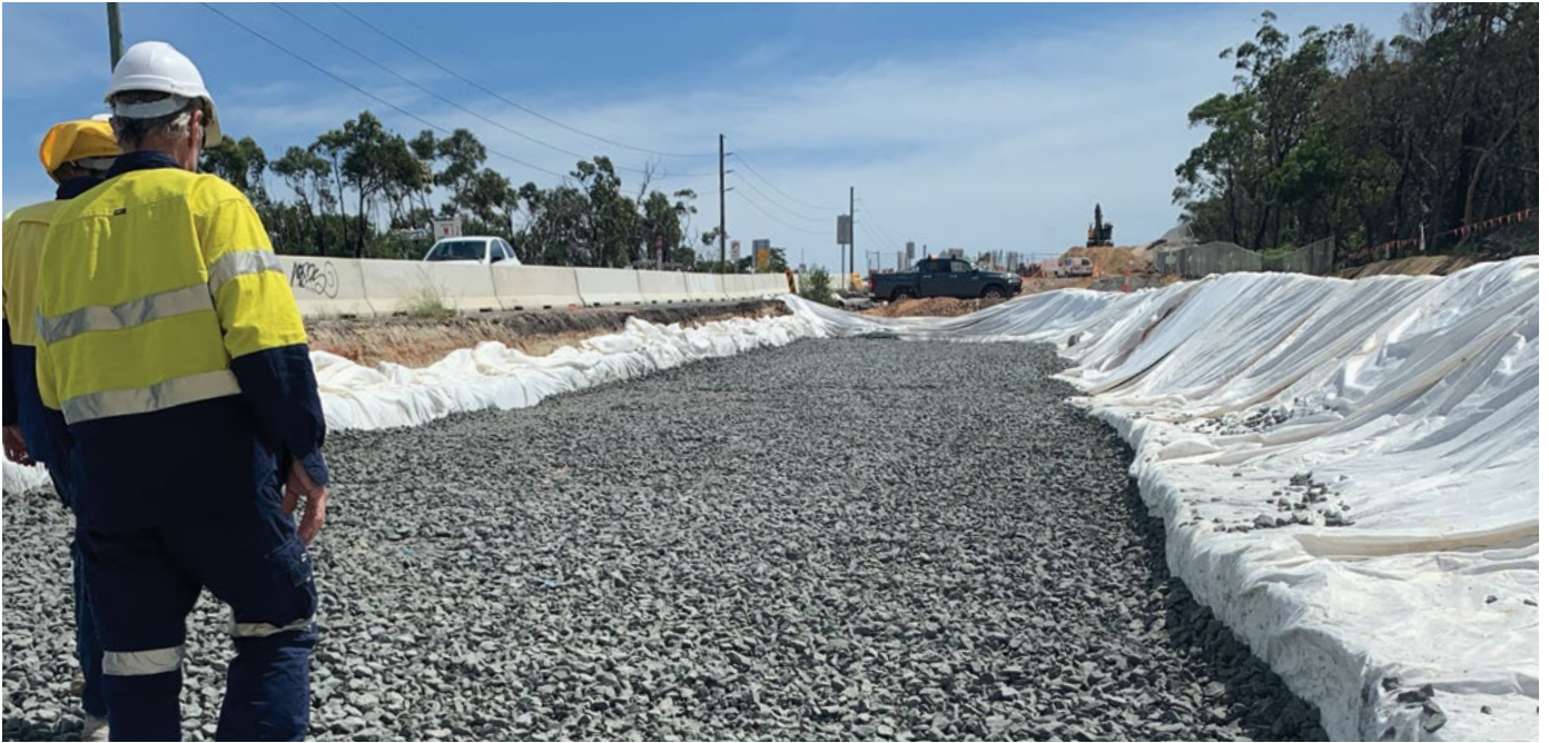
Installing a drainage blanket near Ingleside Road to protect the future road from seeping water