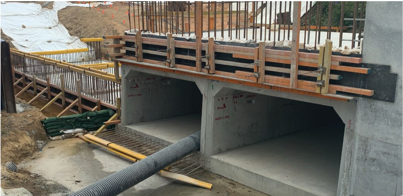
Work to upgrade existing drainage at Narrabeen Creek near Lane Cove Road