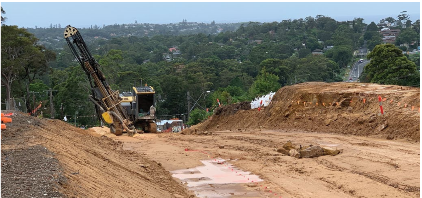
A line drilling excavator working along the future widened road corridor on the northern side of Mona Vale Road near Laurel Road

Road users are encouraged to plan ahead, allow extra time and travel outside the peaks where possible. We will inform you of any changes through electronic messaging and regular notifications, with any major traffic changes advertised in the media.