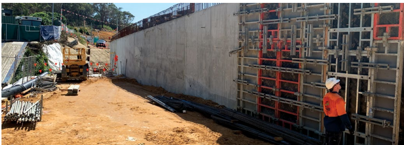
Construction of the retaining wall continues near Lane Cove Road