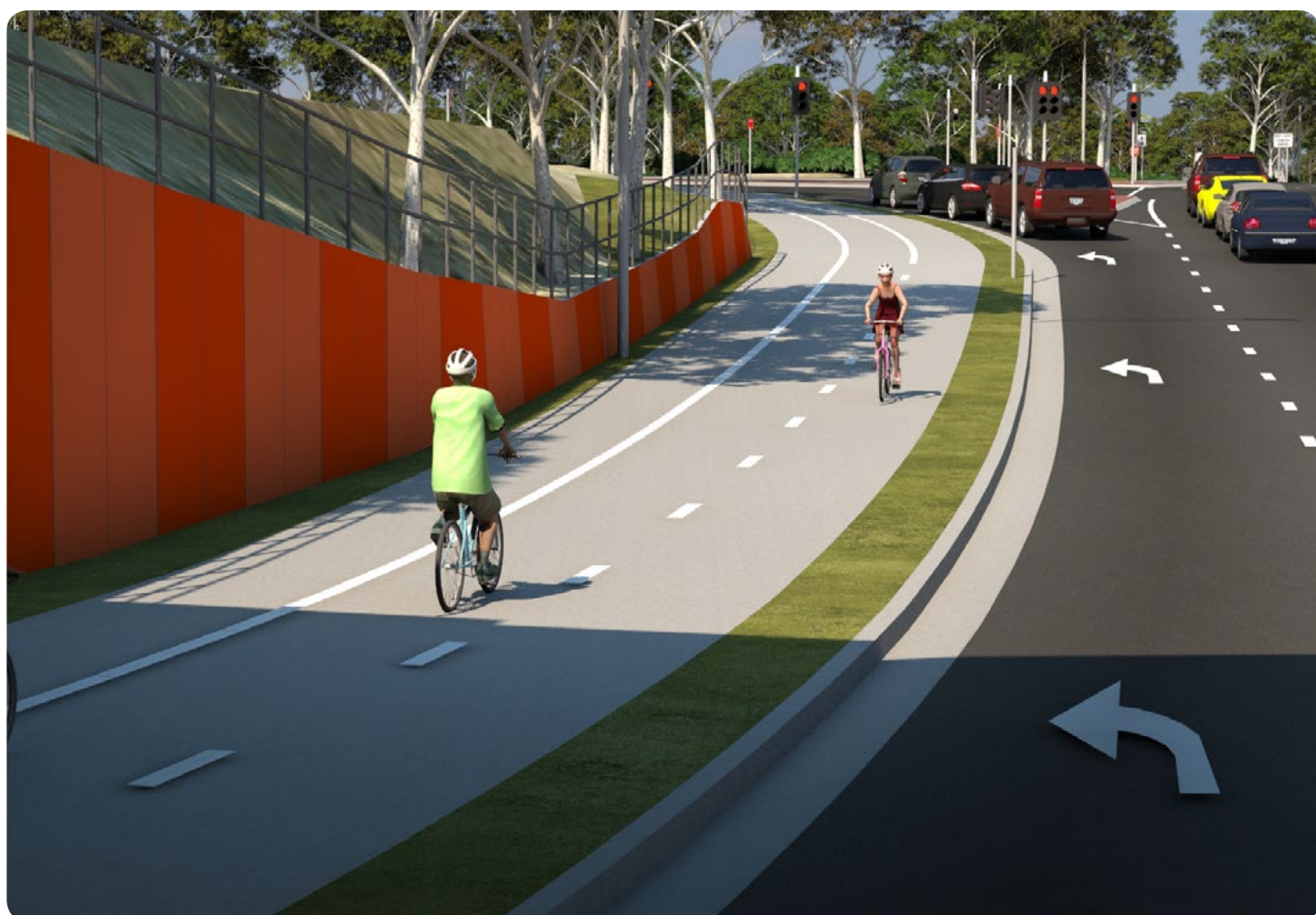
Artists impression: Separated pedestrian and cycle path near the rail bridge and road underpass.

Penrith City Library Theatre, 601 High Street, Penrith