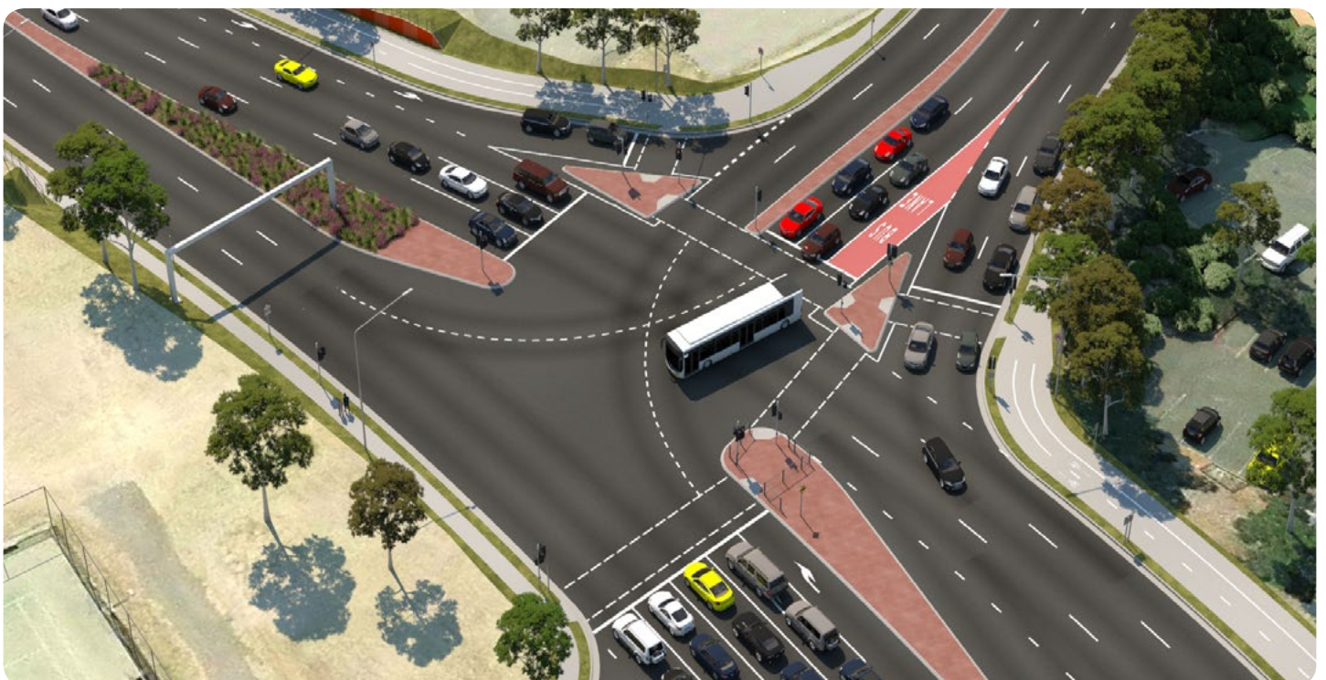
Artists impression: Jane Street and Mulgoa Road intersection

The Australian and NSW governments have jointly committed $70 million toward road improvements to alleviate congestion and improve traffic flow along Mulgoa Road and Castlereagh Road adjacent to Penrith's CBD. Roads and Maritime is seeking comments on the Jane Street and Mulgoa Road Infrastructure Upgrade concept design and Review of Environmental Factors until 16 December 2016 .