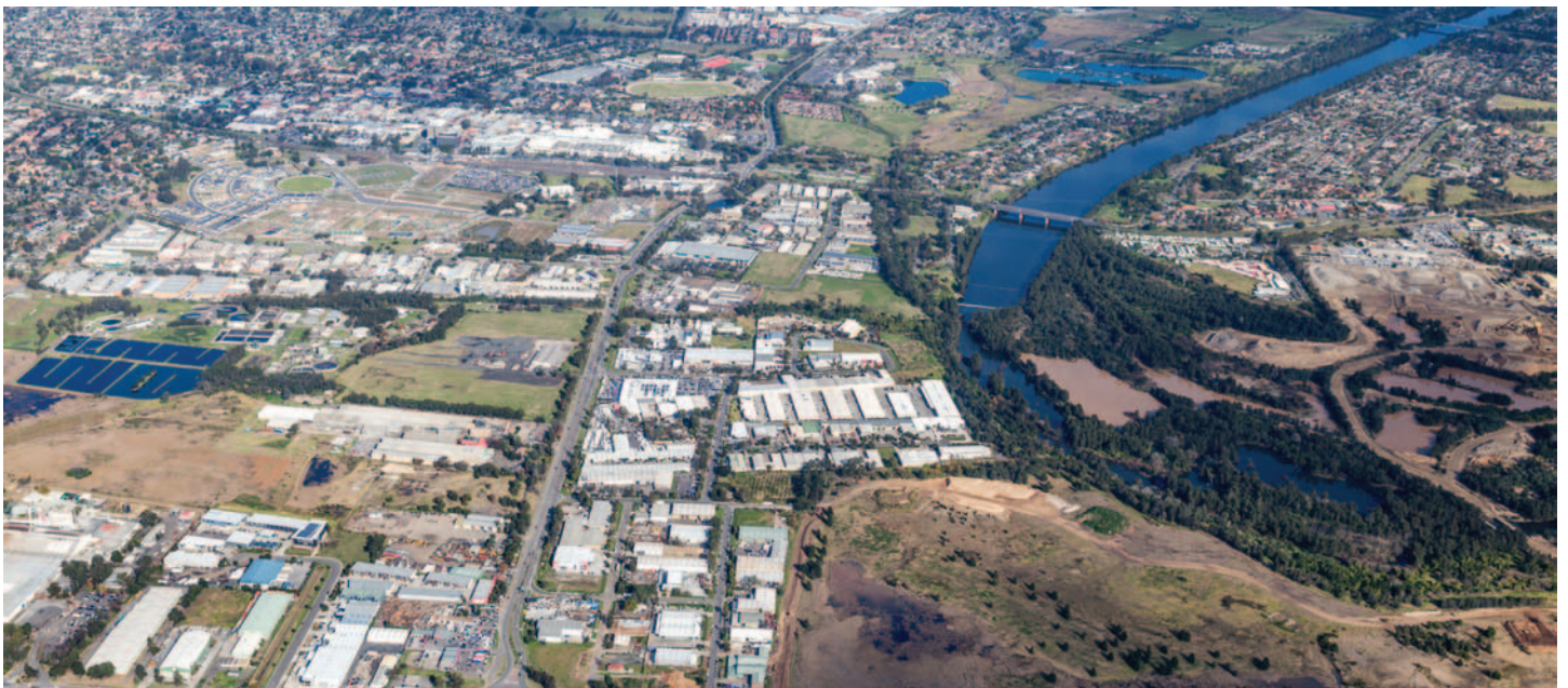
An aerial photo of the Mulgoa Road / Castlereagh Road Corridor

Roads and Maritime Services has started planning for the progressive upgrade and widening of the Mulgoa Road / Castlereagh Road Corridor between Glenmore Parkway, Glenmore Park and Andrews Road, Penrith.