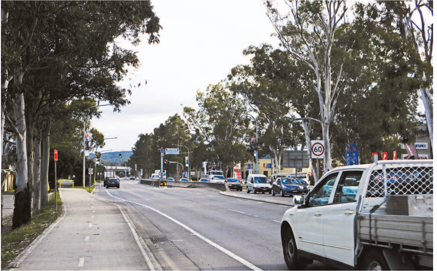
Mulgoa Road looking south towards the M4 Motorway