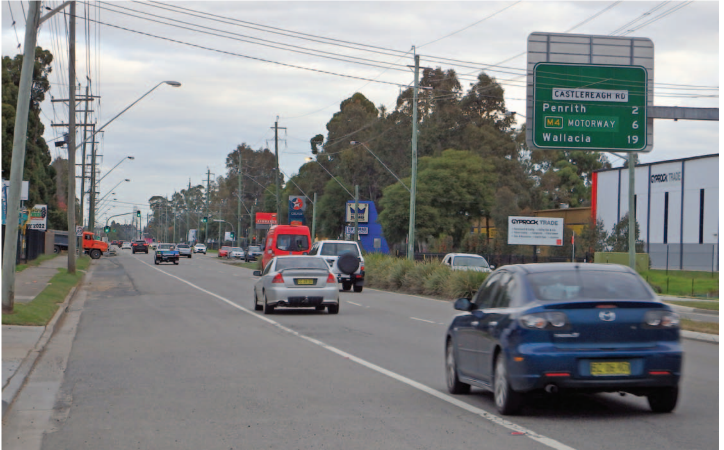
Castlereagh Road looking south towards Penrith CBD