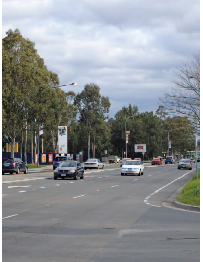
Mulgoa Road looking north to Penrith CBD