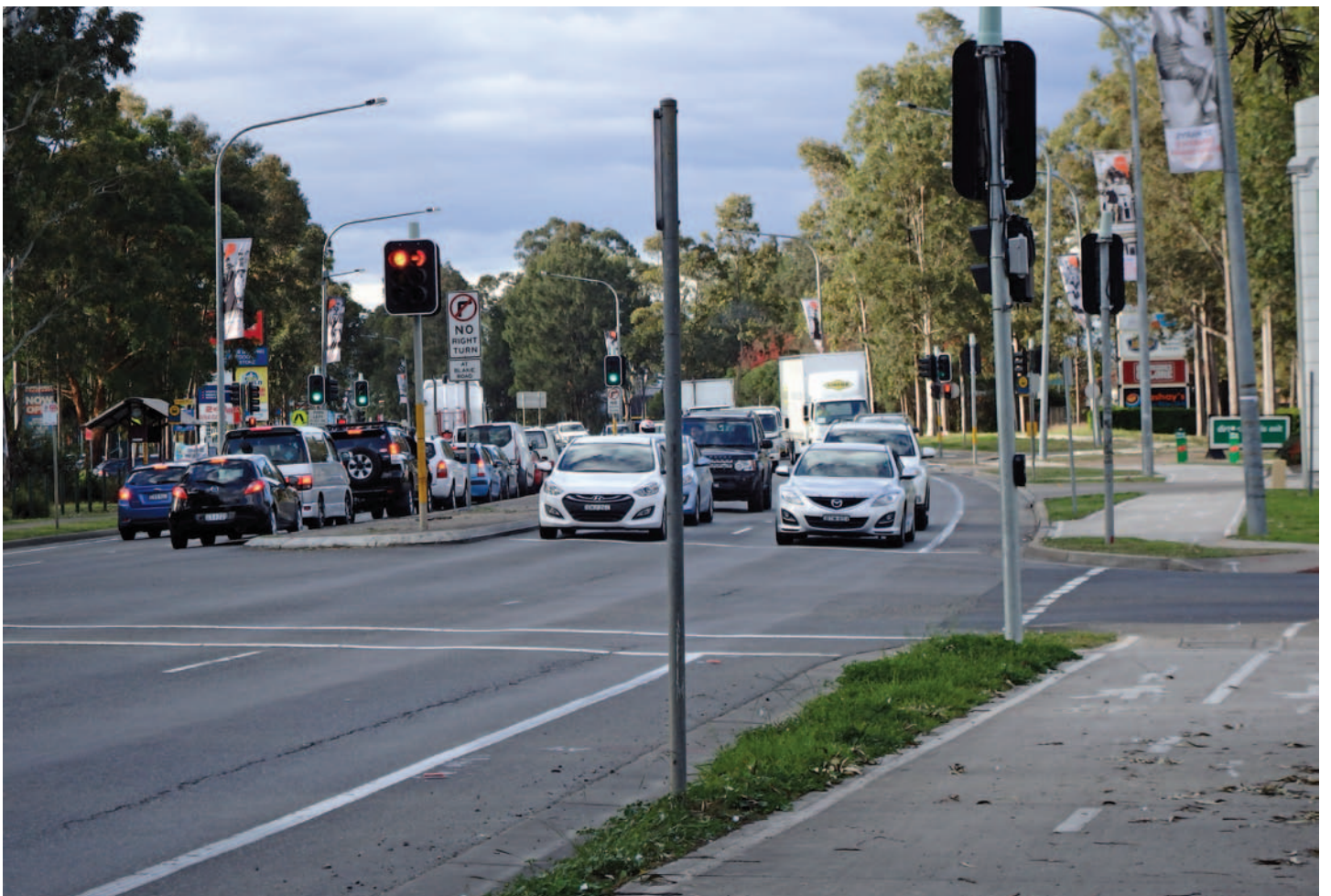
Mulgoa Road southbound