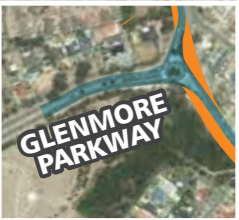
Glenmore Parkway and Mulgoa Road intersection

Please refer to the Staging Plan Map for estimated timing of the proposed short, medium and long term upgrades.