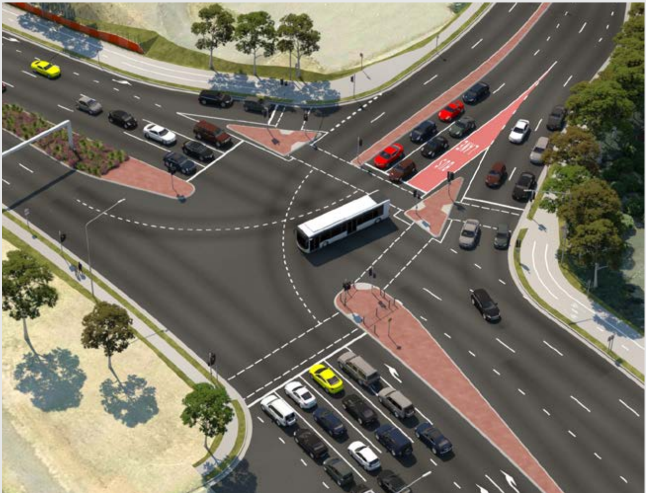
Artists impression: Jane Street and Mulgoa Road intersection

The concept design and Review of Environmental Factors was placed on public display for feedback in November and December 2016. A submissions report summarising feedback received during the consultation period is currently being prepared. For more information about the project, please visit www.rms.nsw.gov.au/JaneStreetMulgoaRoad .