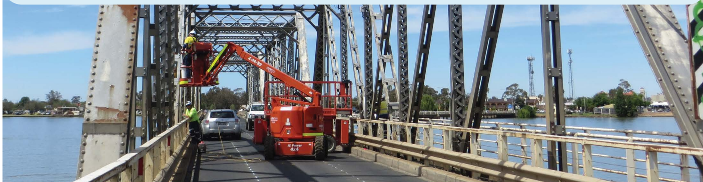
Bridge maintenance on Mulwala Bridge

While this priority ranking has not changed, we are continuing to investigate a preferred option for future certainty and land use planning.