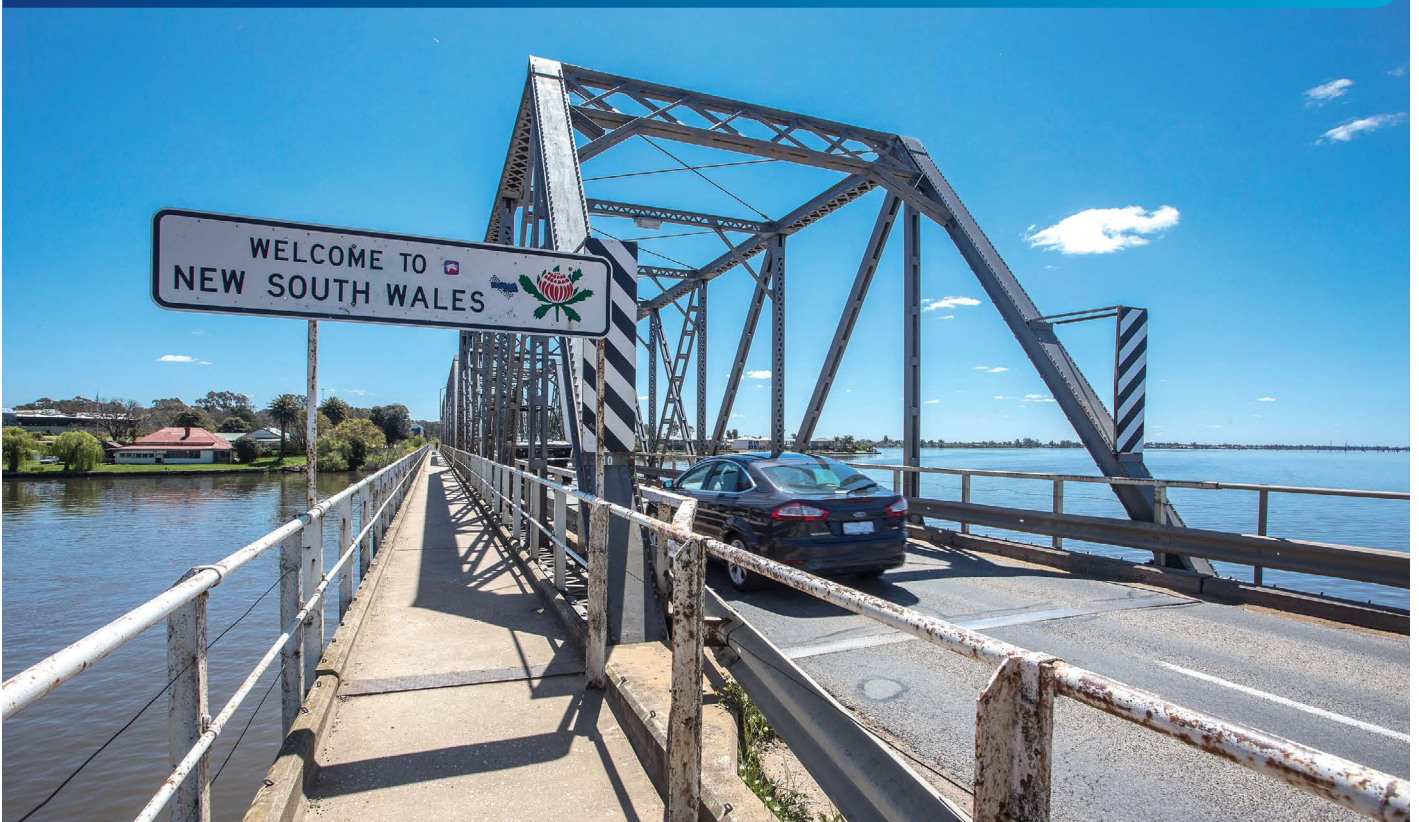
Image of Mulwala Bridge

Transport for NSW, in collaboration with Regional Roads Victoria, is continuing to plan for a future crossing over the Murray River at Mulwala.