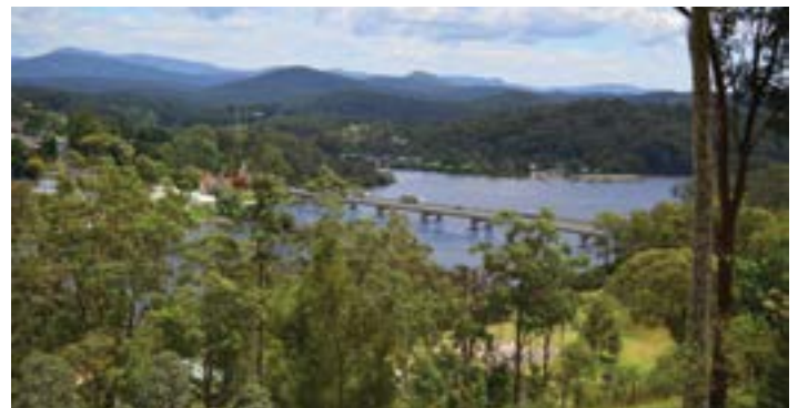
View of the proposed bridge from the east