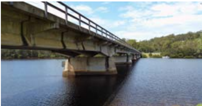
View of the current bridge from the western foreshore