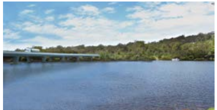
View of the proposed bridge from the western foreshore