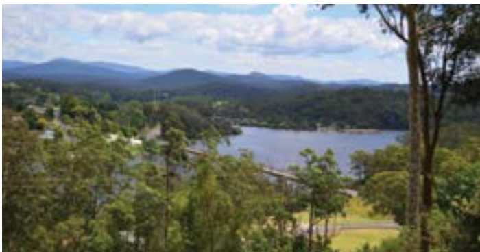
View of the current bridge from the east

Mail: The General Manager Eurobodalla Shire Council PO Box 99 Moruya NSW 2537