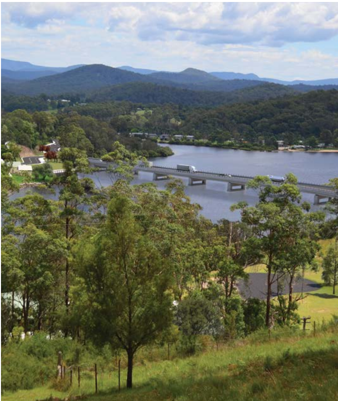
The Nelligen Bridge replacement, looking west