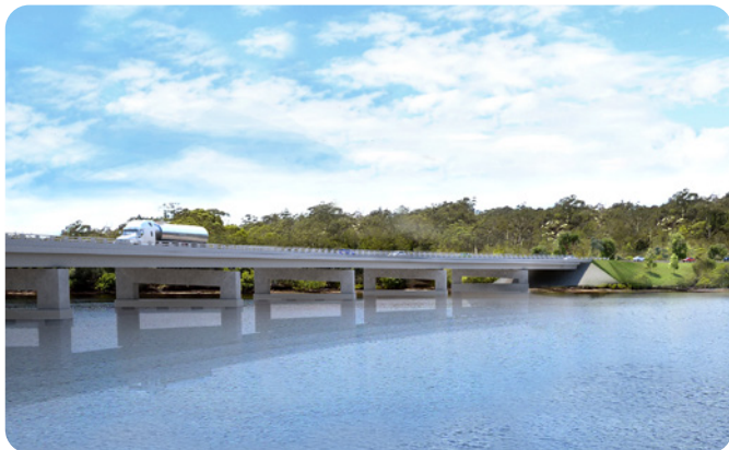
Artists impression of new bridge, looking east