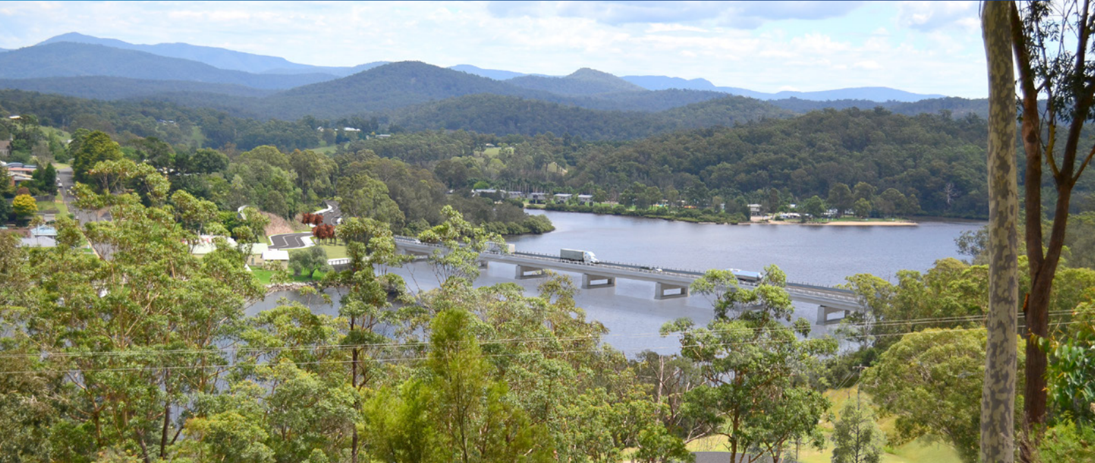
Artists impression of the new bridge, looking west