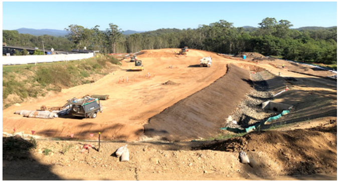
Earthworks on the eastern side of the Clyde River carried out in 2019

There will be some noise associated with this work and we will make every effort to minimise noise such as turning off machinery when not in use and scheduling noisier activities during the day.