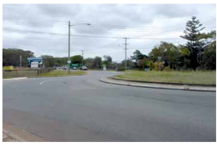
Nelson Bay Road - view west on approach to Port Stephens Drive roundabout