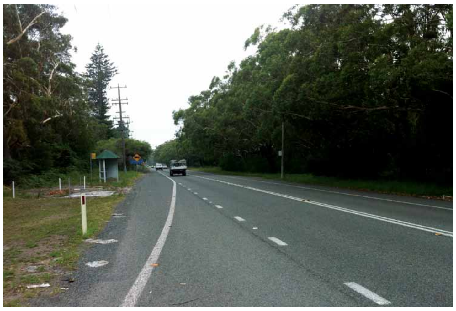
Nelson Bay Road is being duplicated with safe access for adjoining properties and bus bays