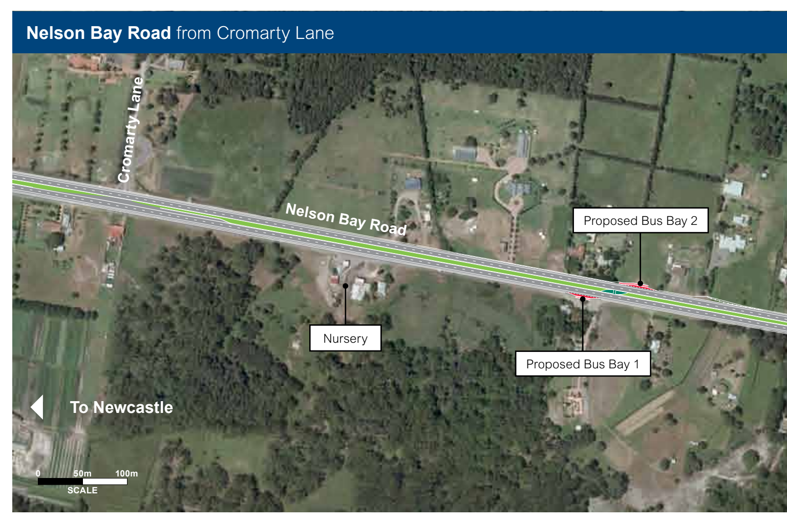
Aerial photograph – Nelson Bay Road, December 2009