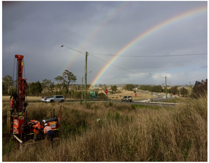
INTERSECTION: New England Highway and the Golden Highway.