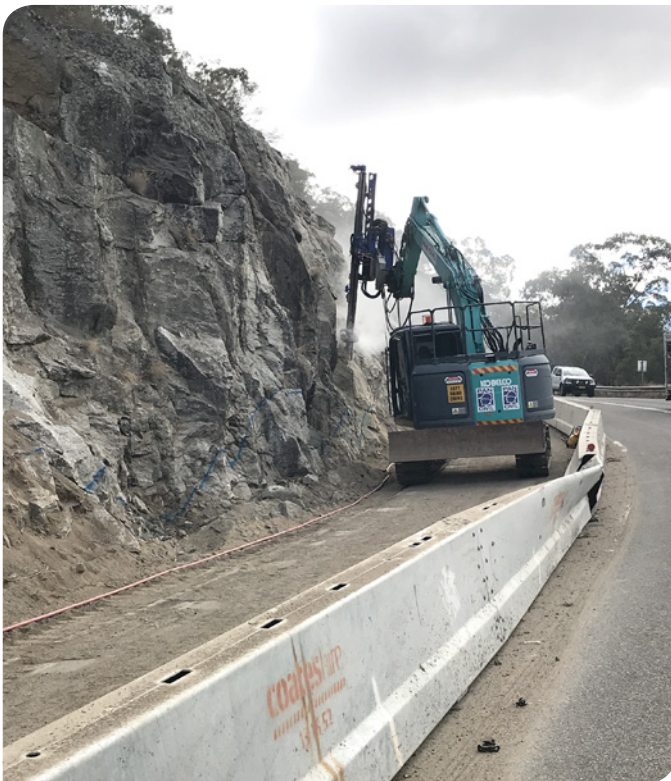
Moonbi Range upgrade, rock face excavation