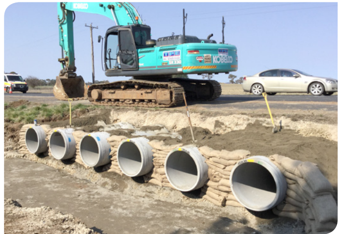
New culverts to improve drainage and widen the road between Uralla and Armidale