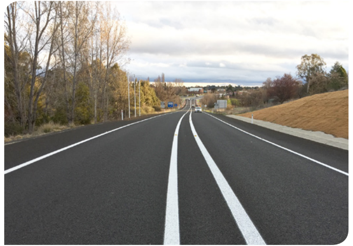
New England Highway new wide centre line treatment entering Uralla

This planned work comes on top of the upgrade of the Moonbi Range earlier this year. This windy, steep section of highway is now wider and safer with improved drainage. A substantial amount of work was also carried out to stabilise the rock face adjoining the highway.