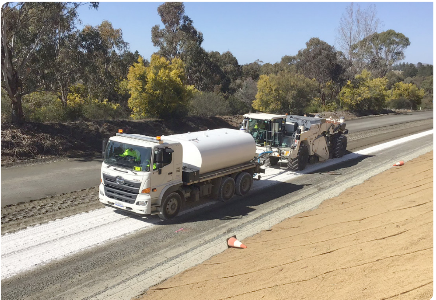
Work to widen and reseal a section of New England Highway north east of Uralla