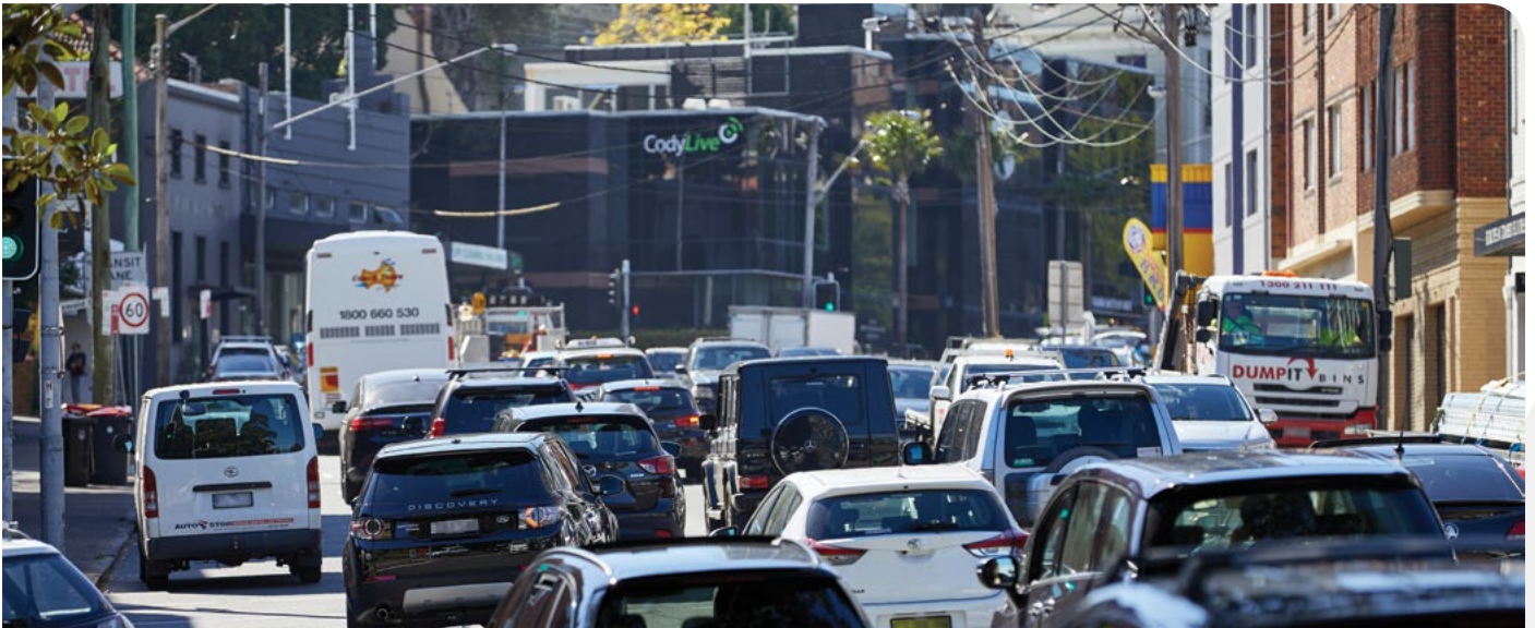
Traffic on New South Head Road

The NSW Government is delivering easier, faster and safer travel on Sydney's roads.