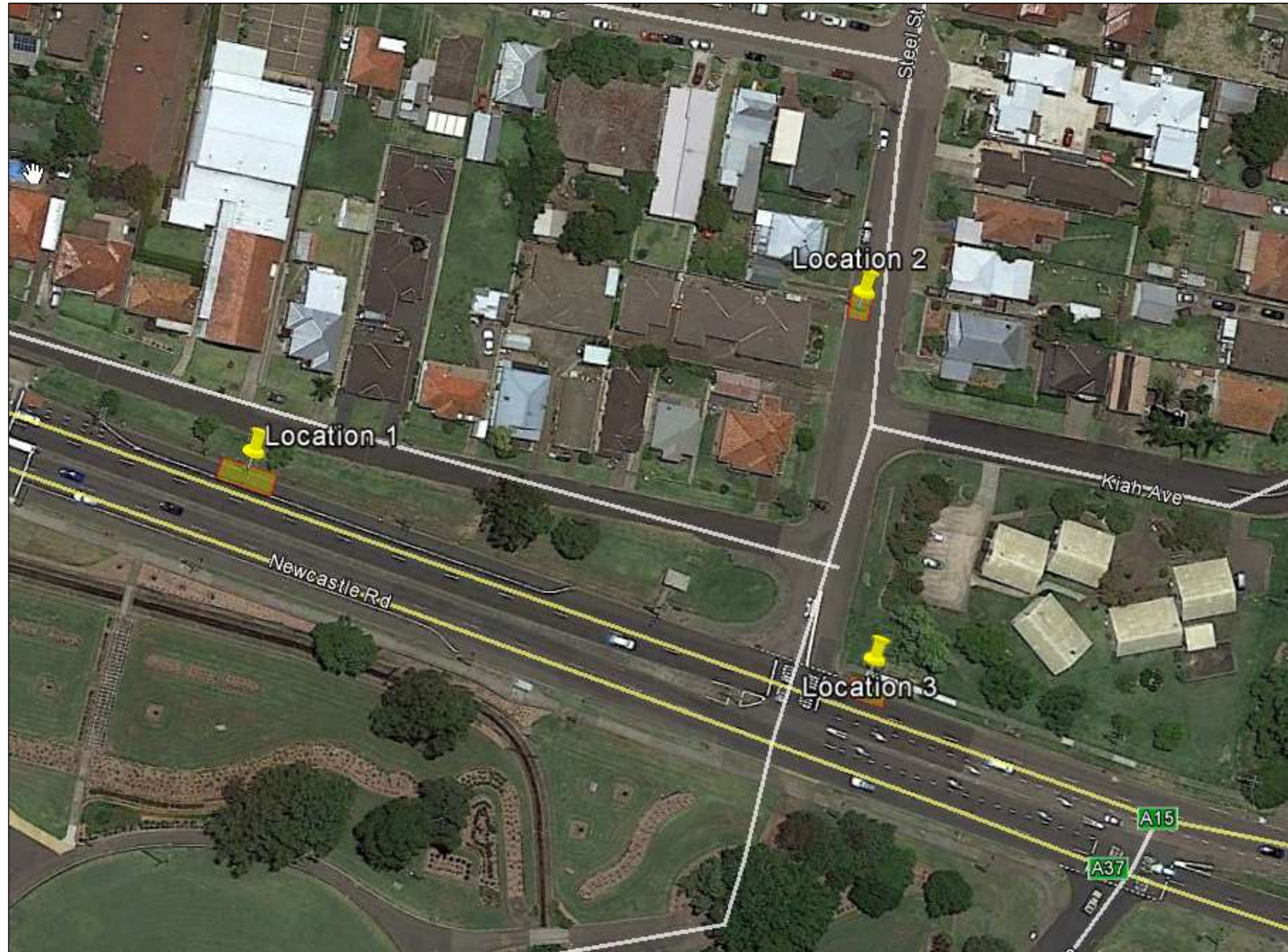
Figure 1: Works Location