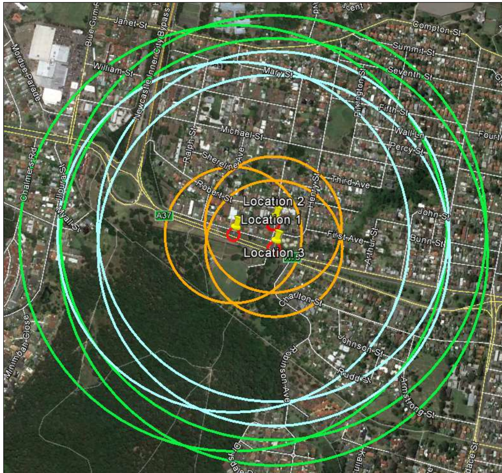
Figure 3: OOHW Night Period 2 – No Attenuation Applied

* Noise Modelling - Assumes line of sight to receiver