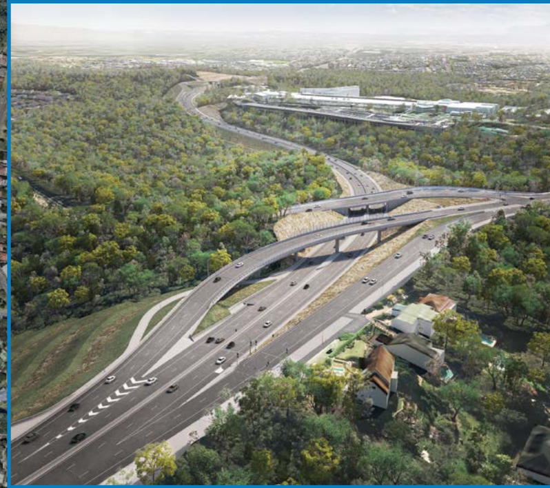
Southern interchange (looking north)