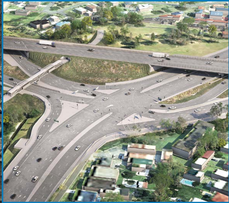
Northern interchange (looking west)