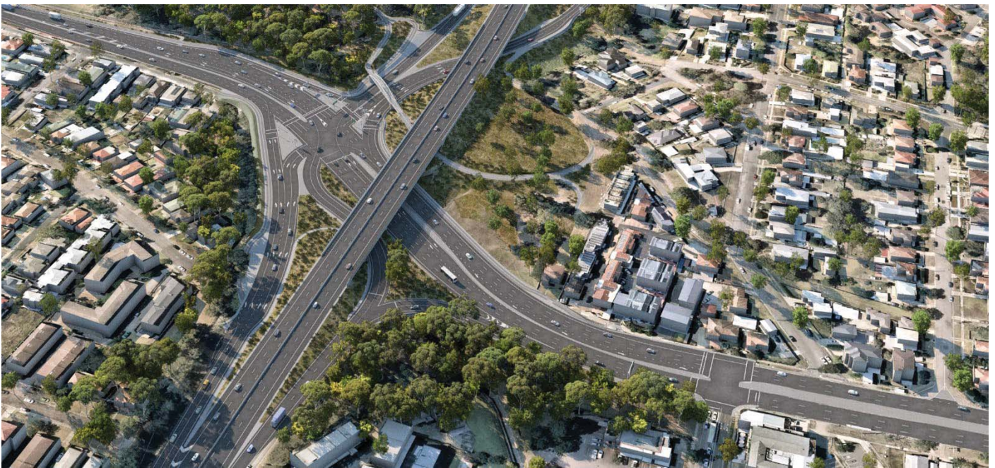
Artist's impression of the refined northern interchange design looking south.

The NSW Government is funding the fifth section of the Newcastle Inner City Bypass between Rankin Park and Jesmond. This section is a proposed new 3.4 kilometre bypass between Lookout Road at New Lambton Heights and Newcastle Road at Jesmond, passing to the west of the John Hunter Hospital.