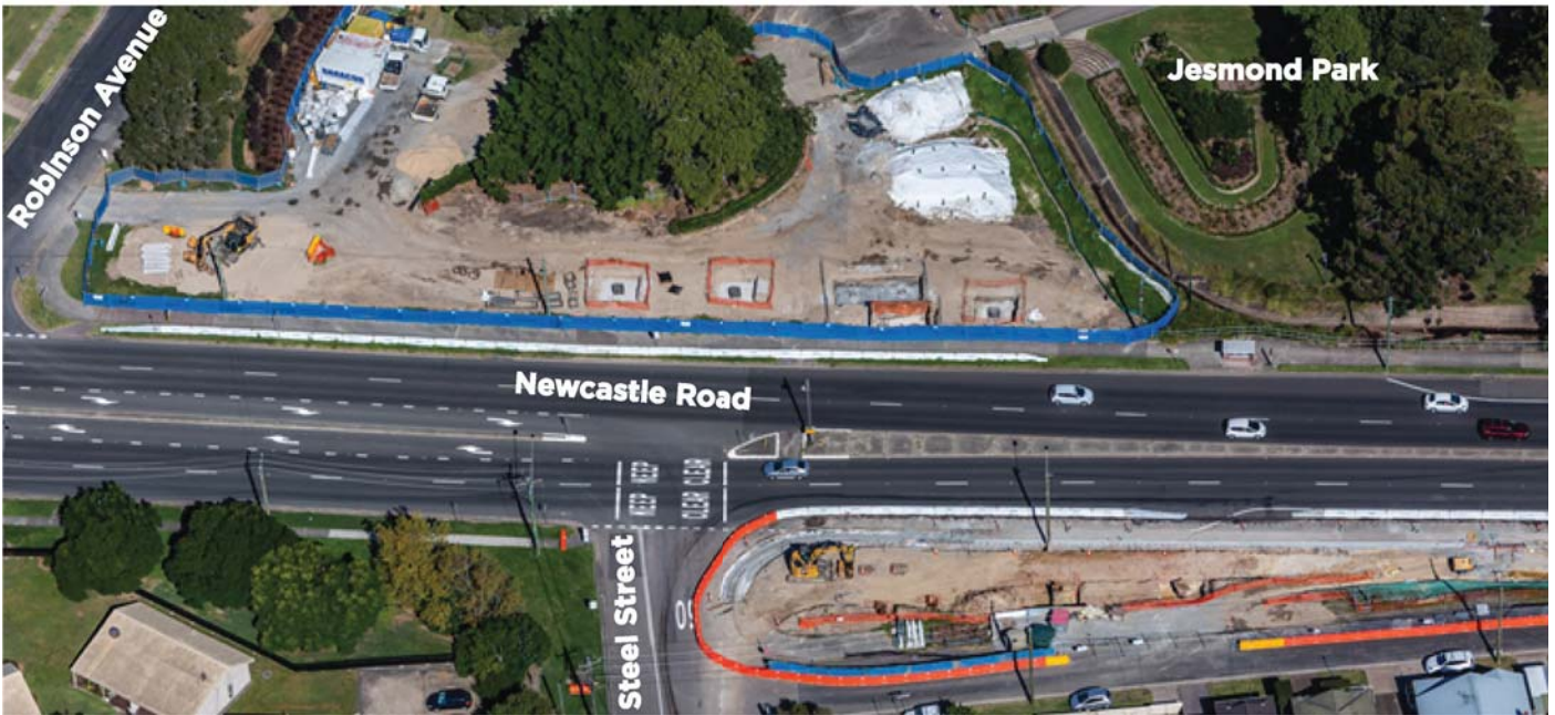
Aerial view of shared path bridge building site at Newcastle Road, Jesmond.