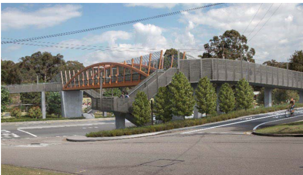
Artist's impression of the shared path bridge.

We are continuing to plan the installation and more information will be provided to you soon.