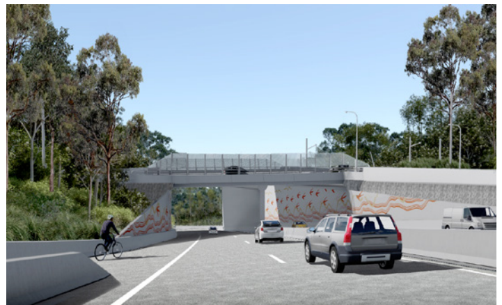
Artist impression of the bypass heading northbound towards Jesmond, passing under McCaffrey Drive

Work will be carried out from 7am to 6pm on weekdays and 8am to 5pm on Saturdays until December, weather permitting. To minimise impacts to motorists, some night work will also be carried out.