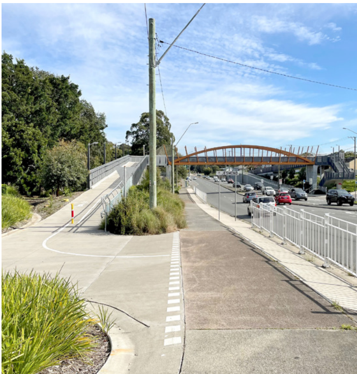
A shared path bridge over Newcastle Road at Jesmond was completed in early 2021 as early work on the project.

Early work also included relocation of major utilities and preliminary road work on Lookout Road and McCaffrey Drive which was completed in August 2022. This early work will help to accelerate work at the southern interchange when major work starts..