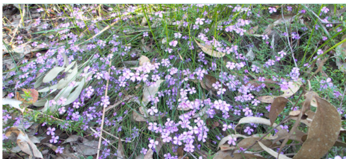
Black-Eyed Susan - ( Tetratheca juncea )

When the project is complete, more than 50 hectares of similar vegetation to the project corridor will be protected for future generations.