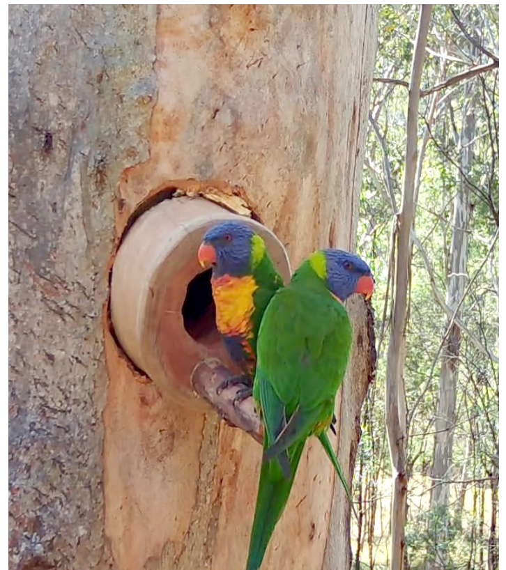
Two lorikeets on a carved hollow

The carved hollows will be installed using a 'Hollowhog' which allows new tree hollows to be carved while having minimal impact on the health and integrity of the tree.