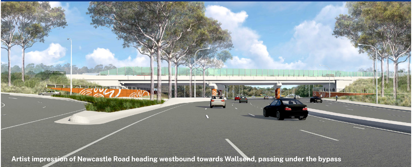
Artist impression of Newcastle Road heading westbound towards Wallsend, passing under the bypass

The Australian and NSW governments are funding the Rankin Park to Jesmond section of the Newcastle Inner City Bypass. The bypass will be built to the west of John Hunter Hospital.