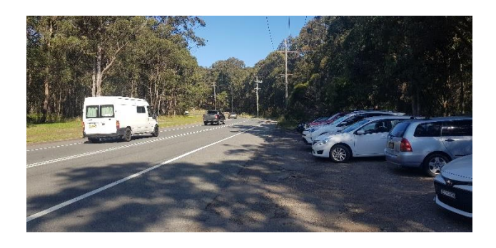
Photo 1: View looking north east along McCaffrey Drive towards the project