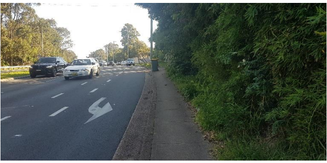
Photo 6: View looking south, just south of the intersection of McCaffery Drive and Lookout Road.