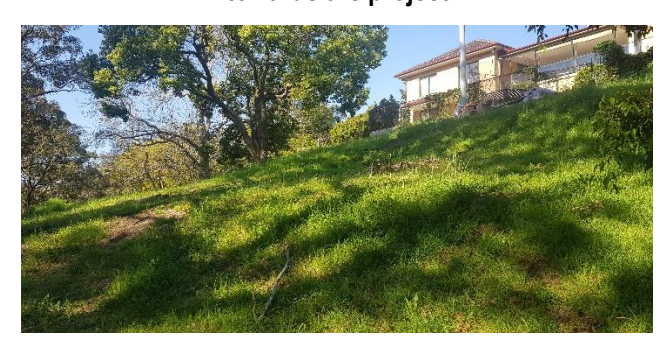
Photo 4: Cleared and grassed area behind houses on the western side of Lookout Road. Houses to be demolished.