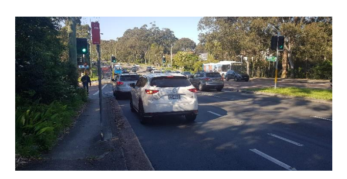
Photo 5: View looking north at the intersection of McCaffery Drive and Lookout Road.