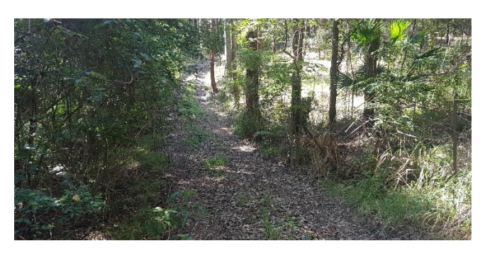
Photo 2: Bush track behind houses on the western side of Lookout Road