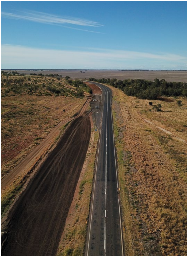
A section of the Newell Highway, north of Whalan Creek Bridge