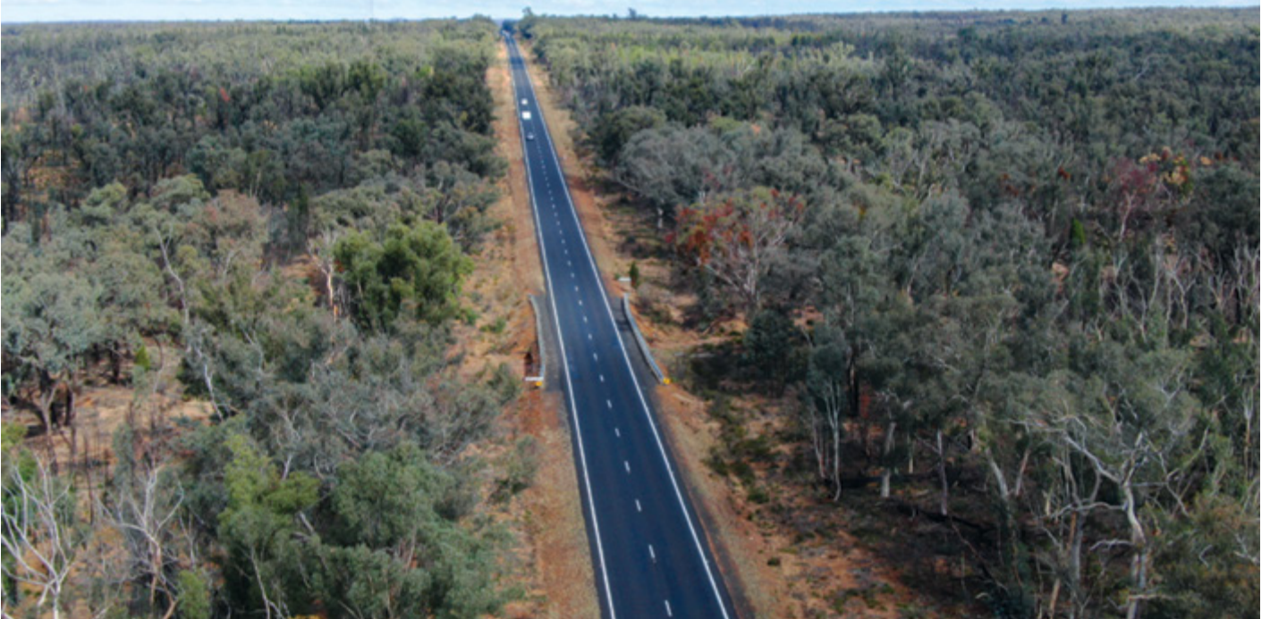
Aerial view of the Newell highway through the Pilliga

The NSW Government has funded $8.8 million to design a wider, safer road along the Newell Highway between Coonabarabran and Narrabri, also known as Pilliga Widening.