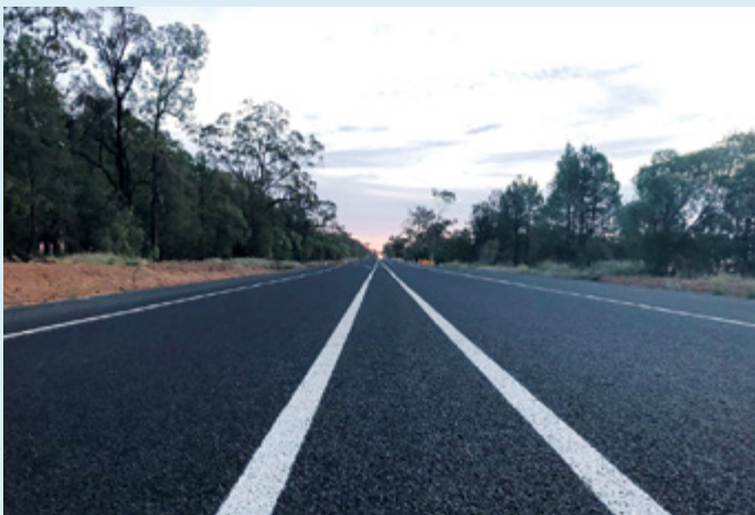
Example of a one metre wide centreline treatment

Seven sections will be assessed as part of the work. These sections are between approximately 10 kilometres north of Coonabarabran and five kilometres south of Narrabri – or more easily identified along the Newell Highway from the Oxley Highway junction to the Kamilaroi Highway junction.