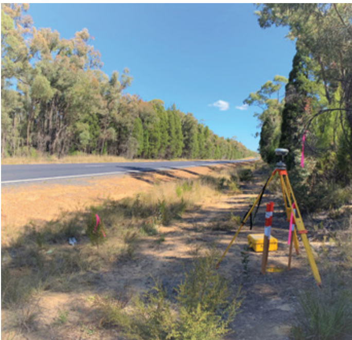
Survey works in progress on the Newell Highway between Coonabarabran and Narrabri

Please keep to speed limits and follow the direction of traffic controllers and signs. For the latest traffic updates, you can call 132 701 , visit livetraffic.com or download the Live Traffic NSW App .