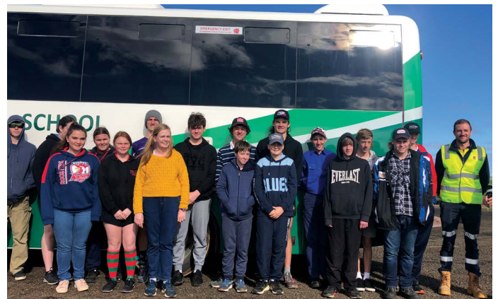
Students from Parkes Christian School on a tour of the Bypass