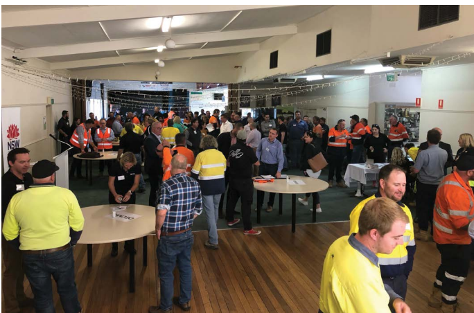
Over 100 local business people attended the Industry Forum

A pre-tender meeting was held for the main Bypass construction contract in April with five prequalified contractors in attendance. The event also included an industry forum to allow local business owners to meet tenderers and discuss opportunities to work on the Bypass. Over 100 business owners from the Parkes area were in attendance whose details were also added to a database which will be supplied to the successful tenderer once the major contract is awarded. If you're a local supplier or business owner, you can register to be included in the database by emailing us on the contact details at the back of this update.