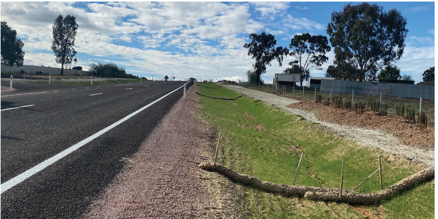
The new Ross Road; complete with landscaping and drainage is now open to traffic, delivered in partnership with Parkes Shire Council

If you need help understanding this information, please contact the Translating and Interpreting Service on 131 450 and ask them to call us on 1800 741 636 (option 4).