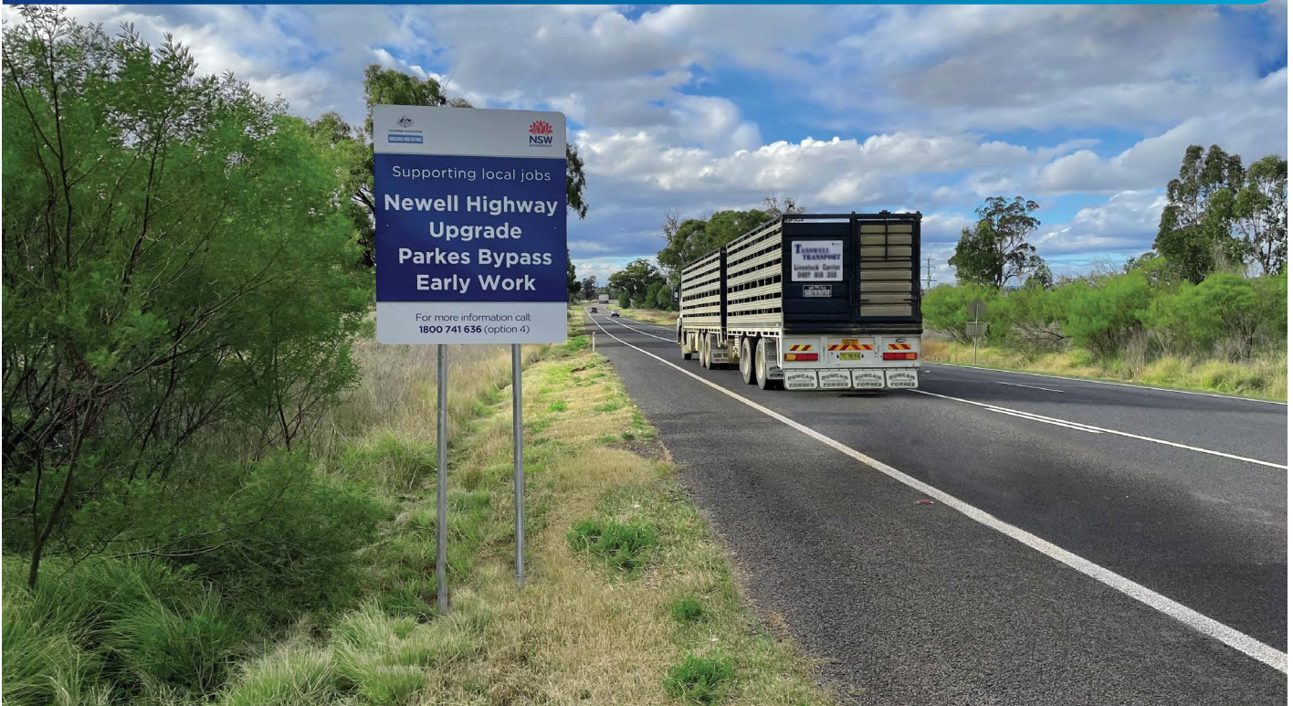
Early works power ahead on the Parkes Bypass

The Australian and NSW Governments are funding the $187.2 million Parkes Bypass, which will improve connectivity, road transport efficiency and safety for local and interstate motorists.