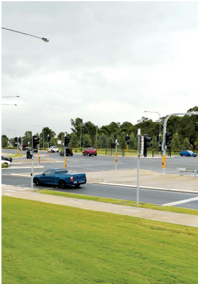
Richmond Road, looking north