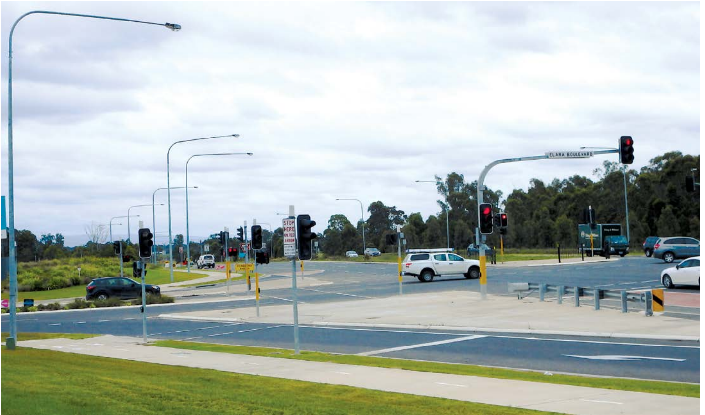
Richmond Road and Elara Boulevard intersection