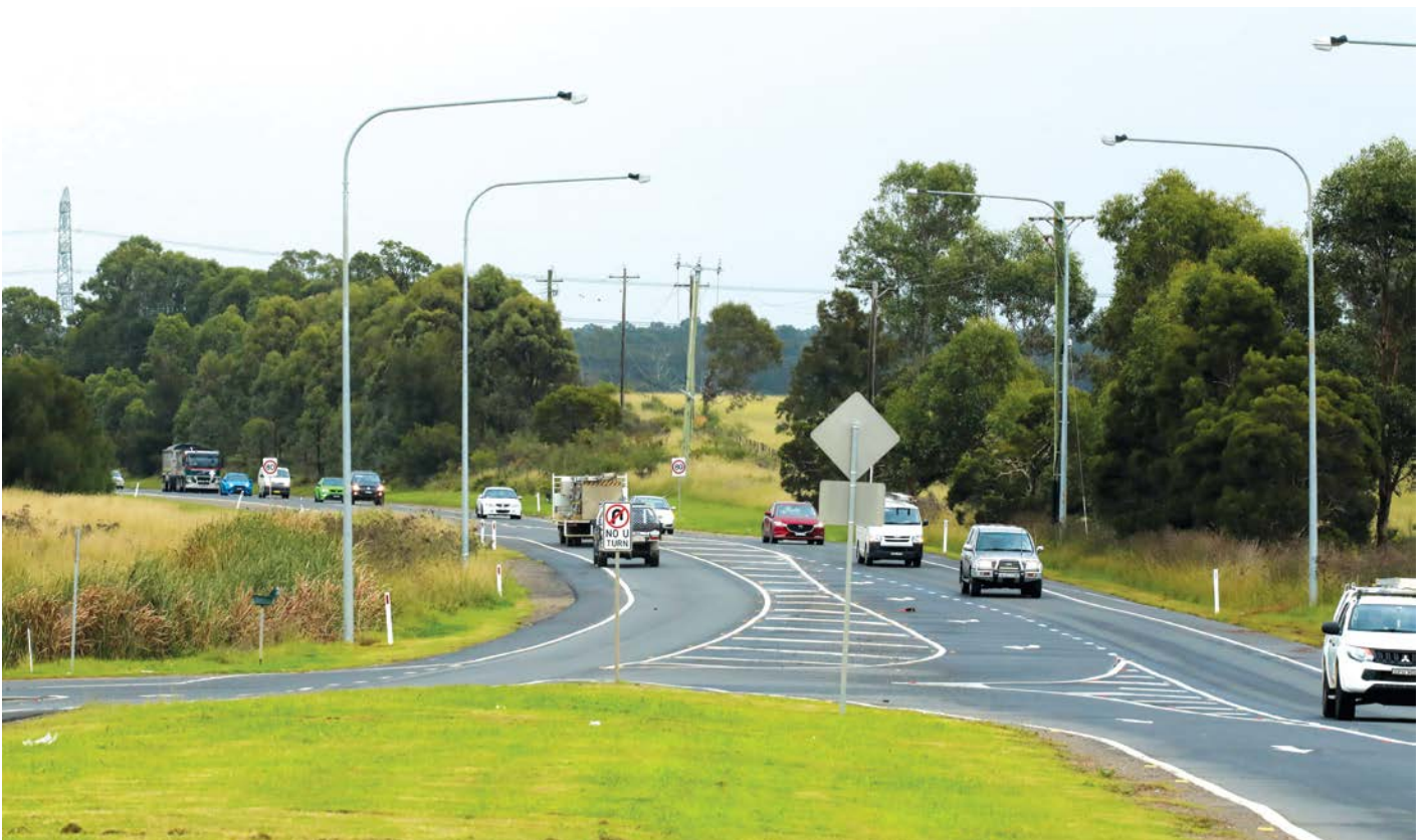
Richmond Road, looking north