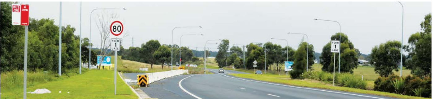
Richmond Road Elara Boulevard Precinct

The NSW Government has proposed a road network to support the forecast growth in the North West Growth Area. Over the next ten years, 33,000 homes will be in the area and once fully developed, the area will be home to around 250,000 people.