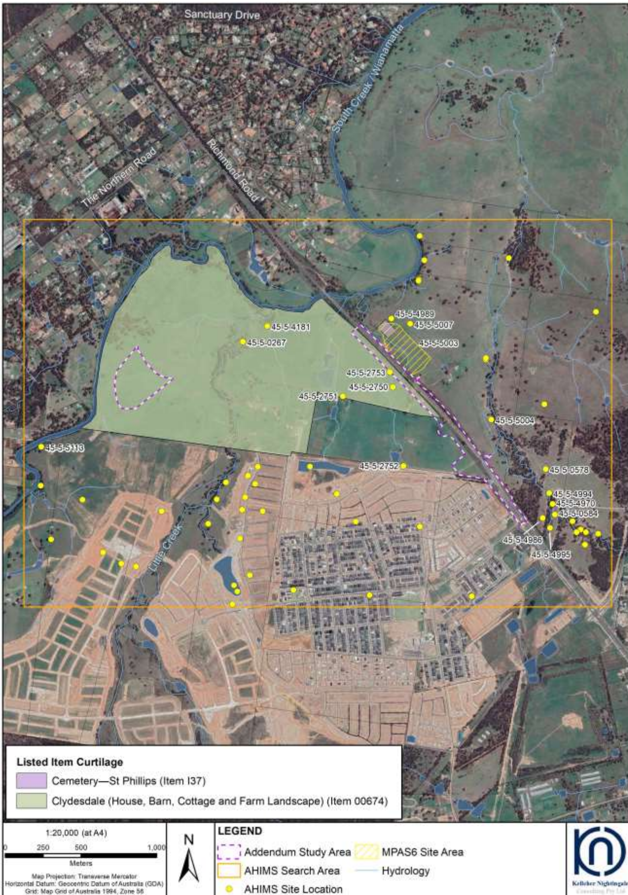
Figure 3. AHIMS search results for the addendum study area