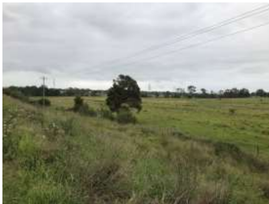
Plate 1. View facing north, showing ground surface modification and filled sloping road embankment to fenceline (left) with location of AHIMS site MPAS6 in background(right).

Particular attention was paid to the site location for previously registered artefact scatter MPAS6 (AHIMS 45-5-5003) to determine the exact location of the previously identified site boundary. The site location was revisited and inspection confirmed that the site did not extent into the addendum study area and will not be impacted by the proposed works.