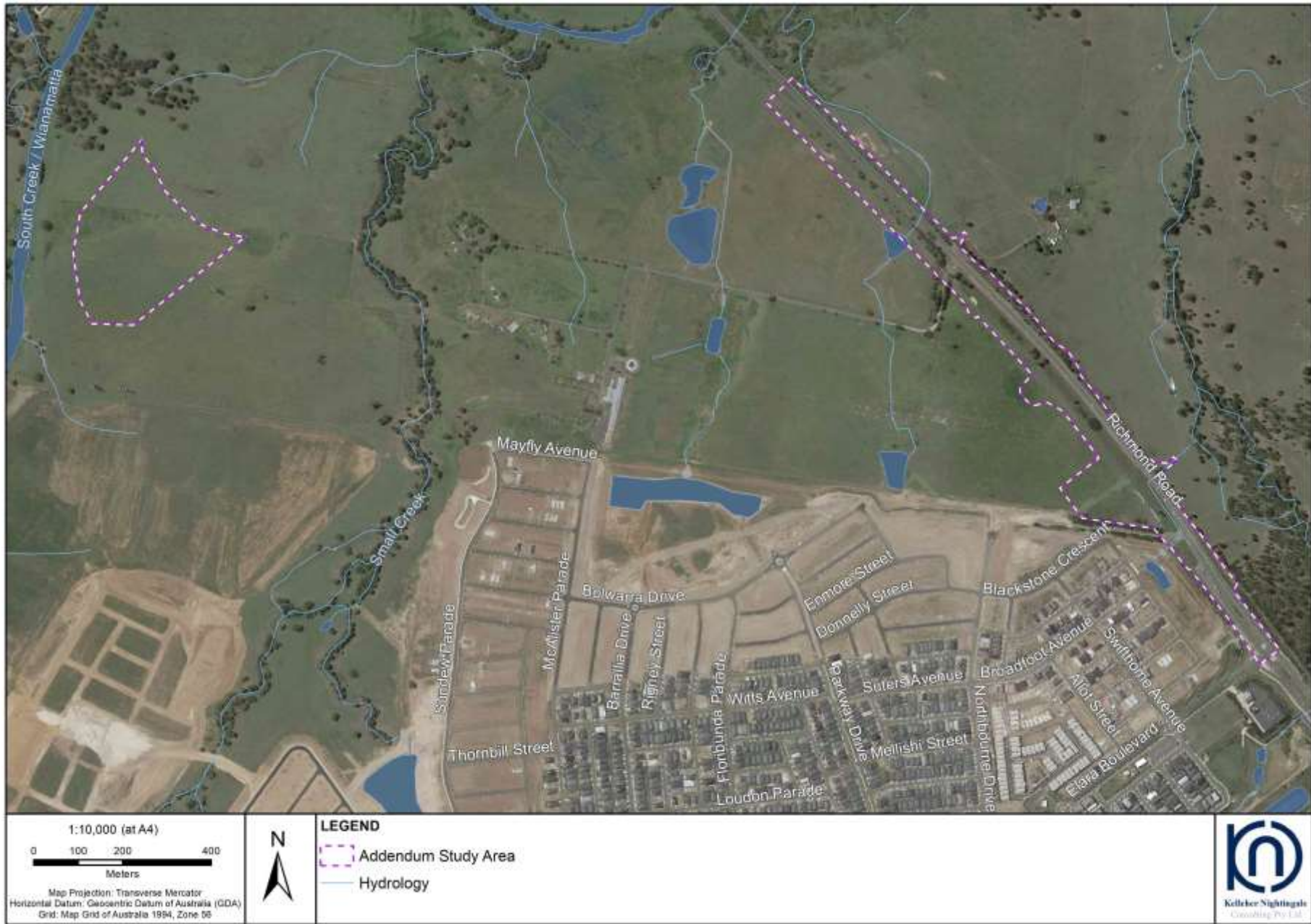
Figure 2. Addendum study area