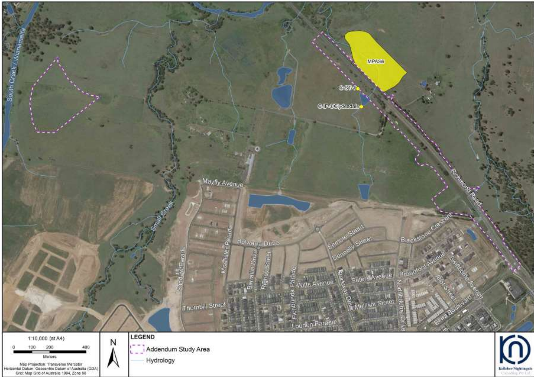
Figure 5. Survey results showing Aboriginal heritage bordering the addendum study area