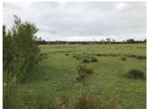
Plate 2. View north across AHIMS site MPAS6 within paddock north of the Richmond Road corridor, along boundary of addendum study area.