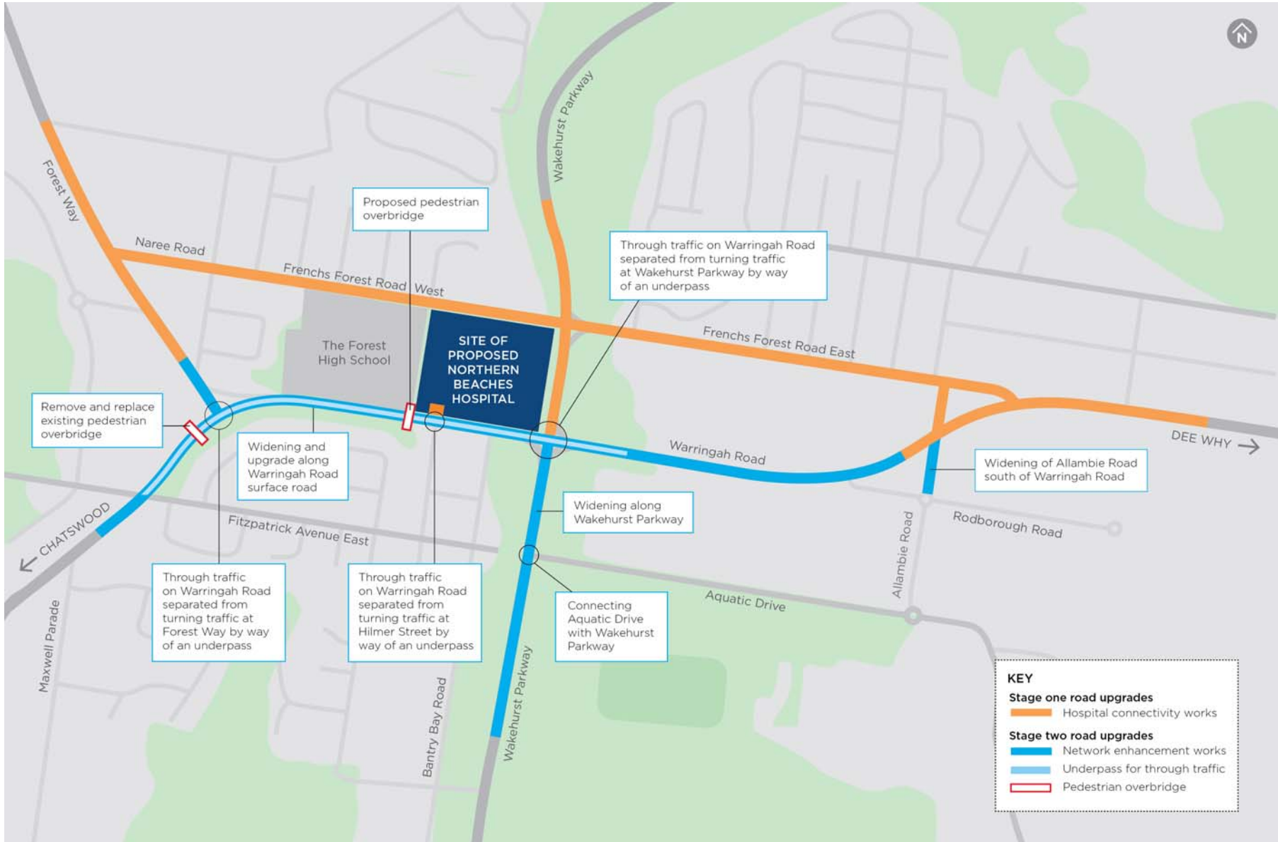
Figure 1-2 Project area and key features