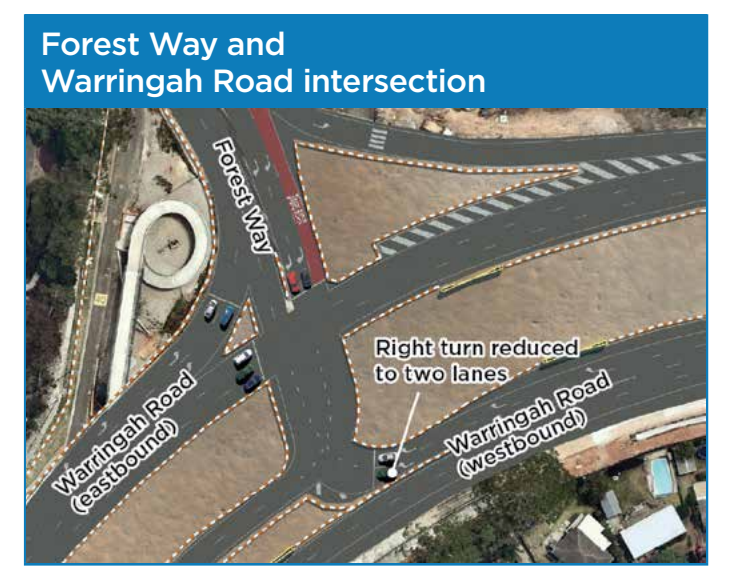
Right turning lanes reduced from three to two lanes.