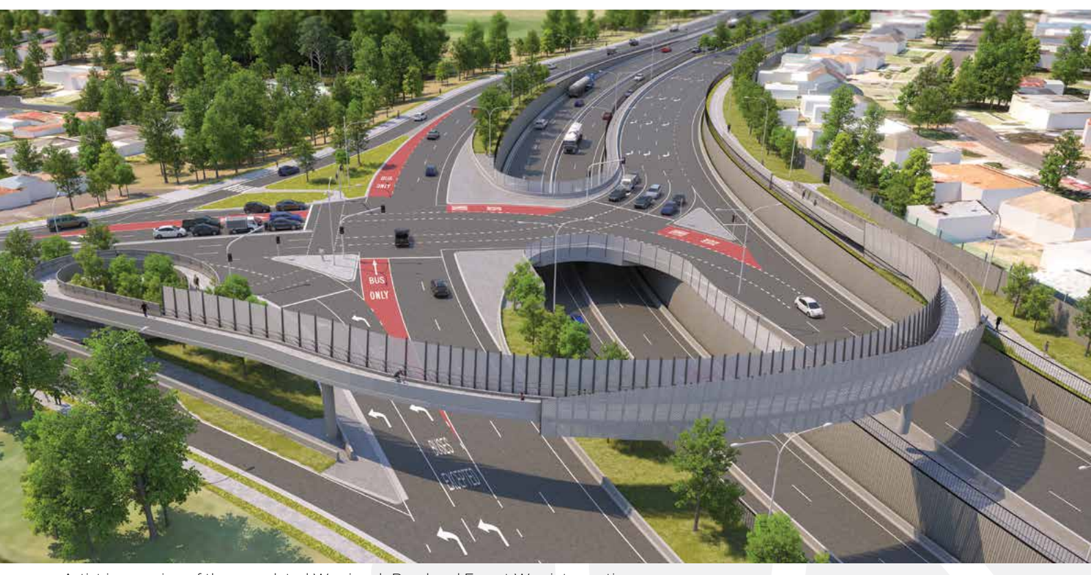
Artist impression of the completed Warringah Road and Forest Way intersection.

The NSW Government is working hard to deliver a new state of the art hospital and upgraded road network for the people of the Northern Beaches.