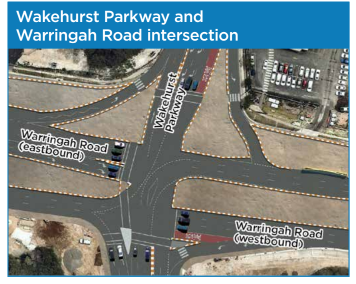
Numerous traffic changes over consecutive weekends are required at this intersection to reach this final arrangement.