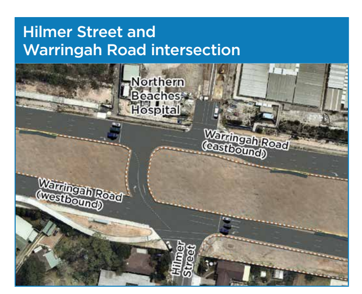
Traffic will swing to the west to allow for the construction of the Hilmer Street overpass.