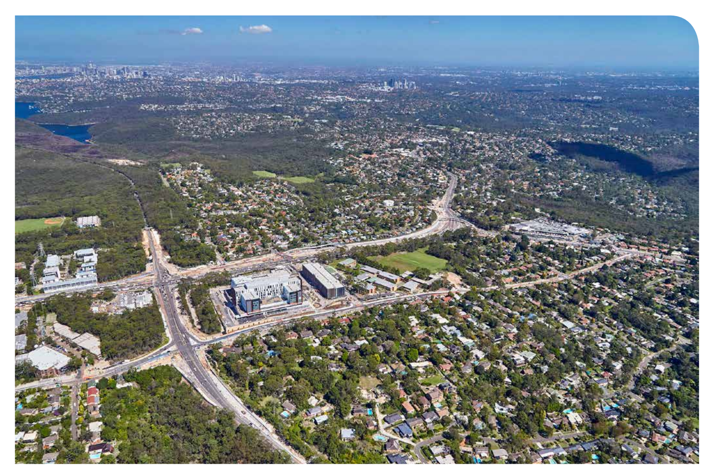
Aerial shot of work progressing along Warringah Road, near the new Northern Beaches Hospital.