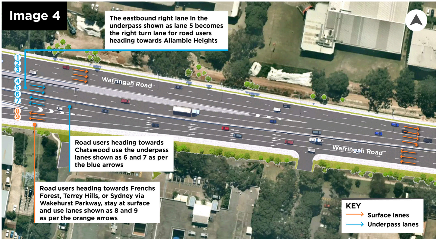
Final arrangement at the eastern end of the Warringah Road underpass