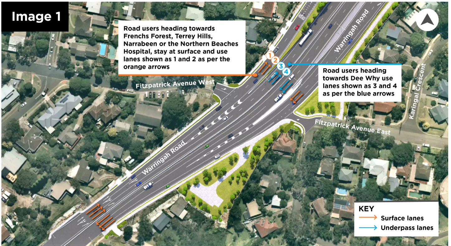
Final arrangement at the western end of the Warringah Road underpass