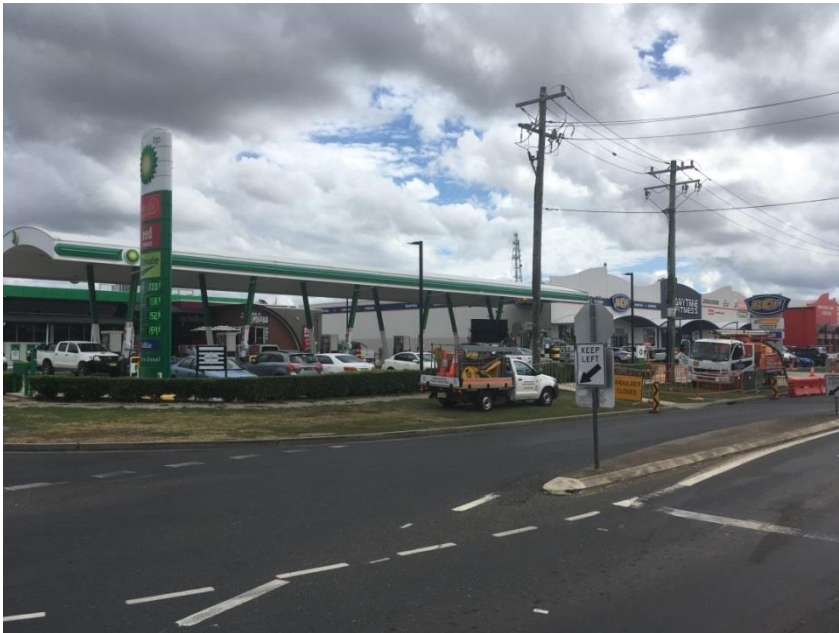
Potholing for services near the BP complex driveway (March 2019)