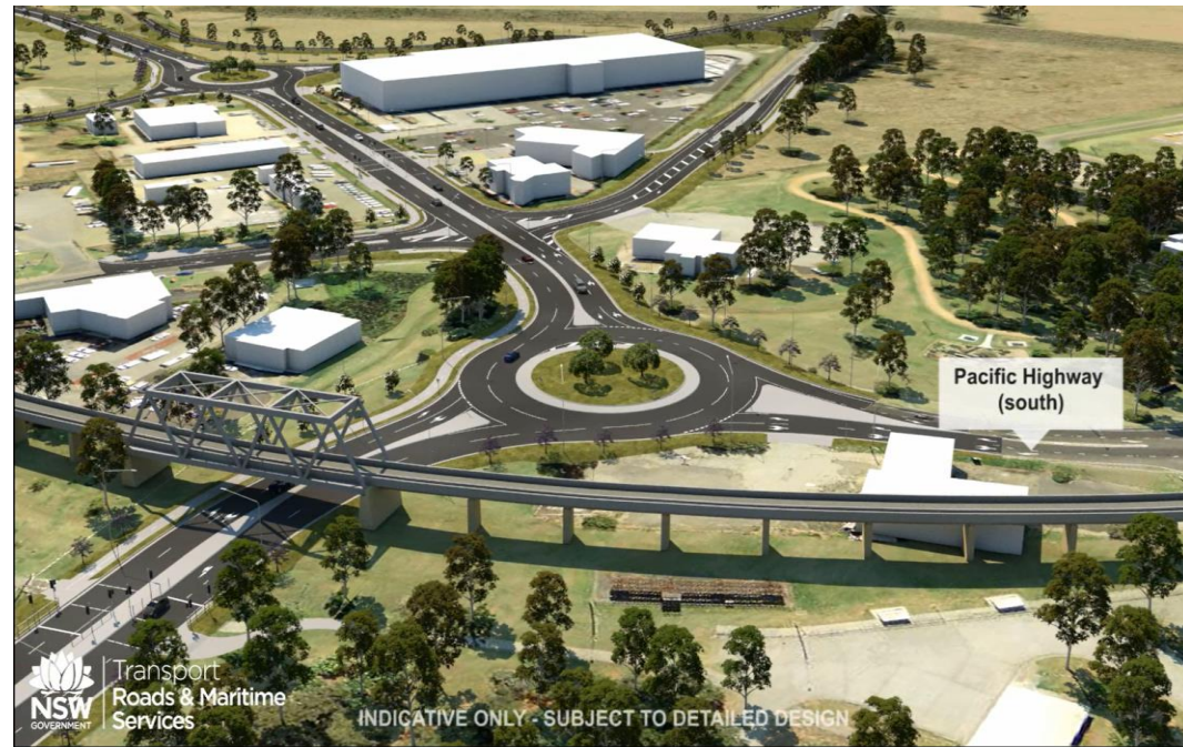
Final arrangement for Iolanthe and Charles streets