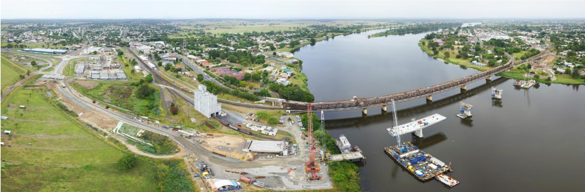
Panoramic view of the project (February 2019)