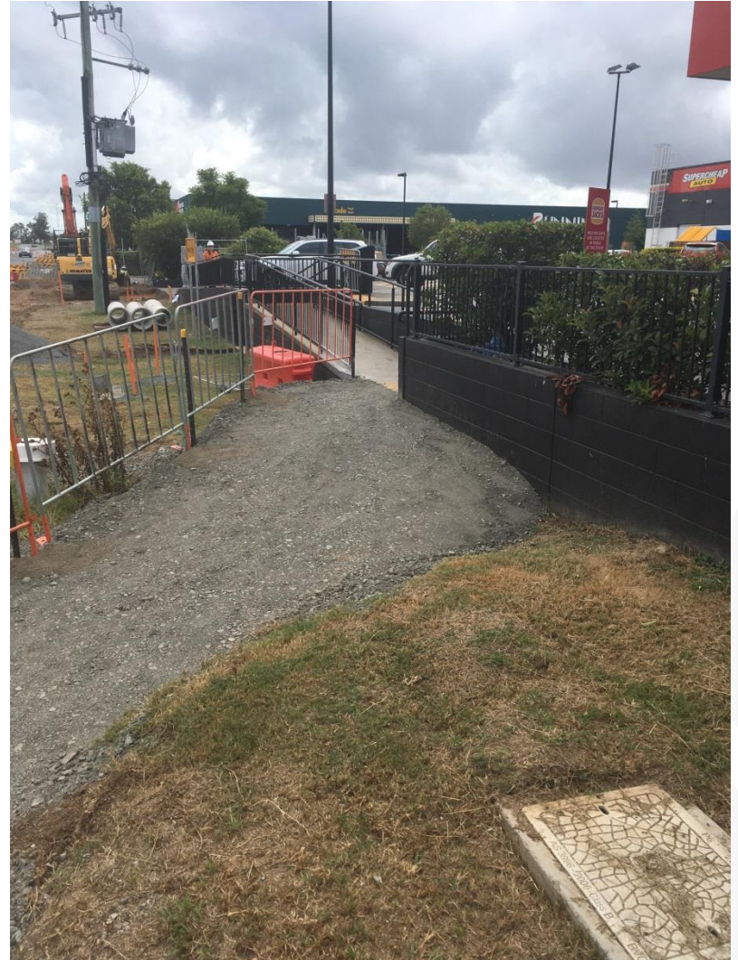
Temporary accesses are being provided for pedestrians as work progresses (March 2019)