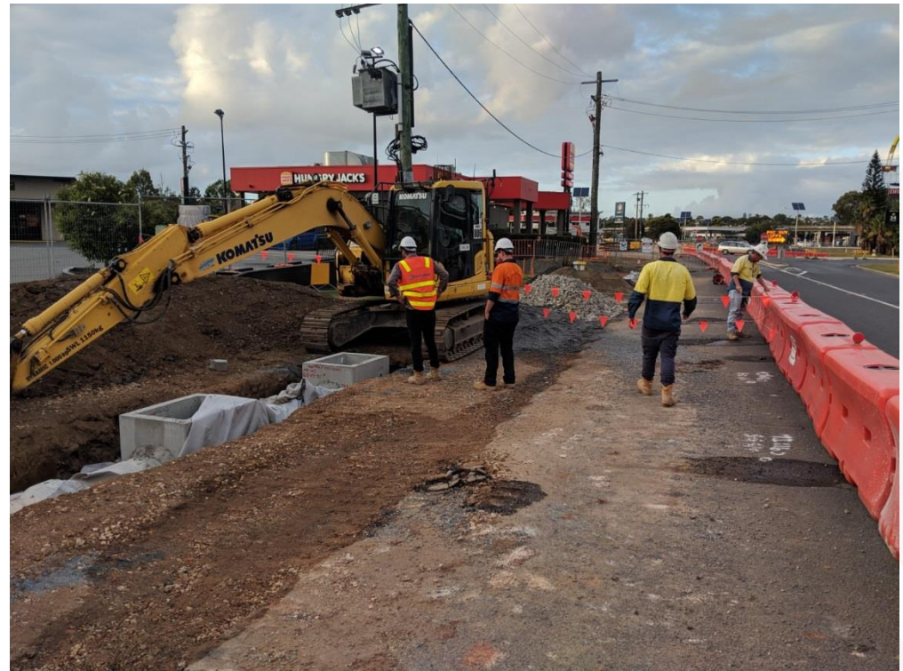
New drainage being installed adjacent to Hungry Jack's, Supercheap Auto and Subway complex (March 2019)