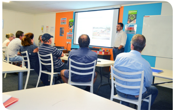
The project team meets with business owners on a regular basis

Members of the project team will be available to discuss the project at the car park at Bunnings on Saturday, 11 August from 9am – 12 noon. You will have the opportunity to get an update on construction activities and ask any questions about the progress of the bridge.