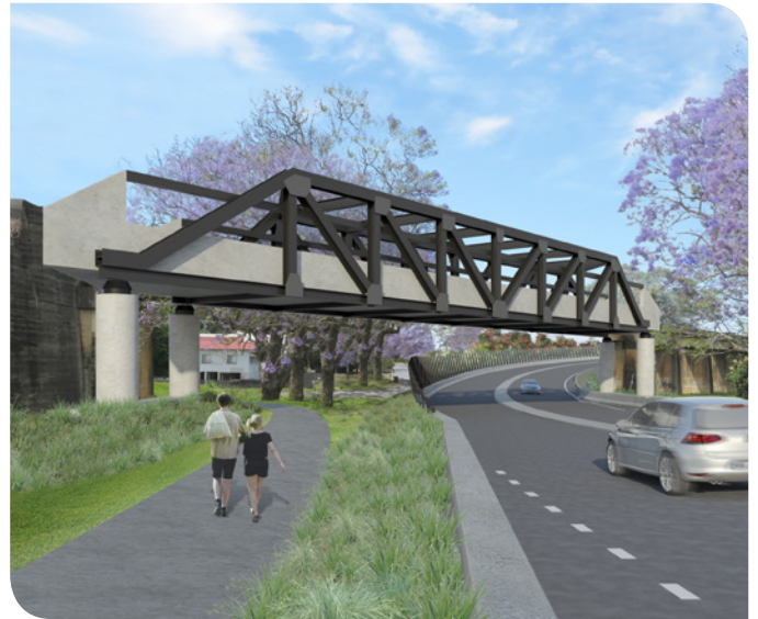
Artist's impression of the new Pound Street rail bridge

Piling for the new rail bridge is expected to be complete this month. This includes four piles 1.2 metres wide and up to 25 metres deep. The new 42-metre single span steel bridge will be built in Sydney and transported to site. Some minor assembly of the new bridge will be done on site. The existing concrete bridge will be demolished and the new bridge will be installed over a three day period to minimise impact on the rail network.