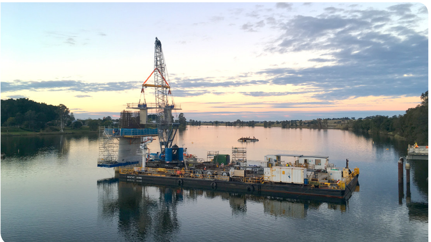
The first segment is lifted into place for the new Grafton bridge project

Once this process is complete for each pier, the spans between can be built. This is done by joining segments to the ones in place over the piers. They must be placed in pairs – with one added to each side - to balance the load.