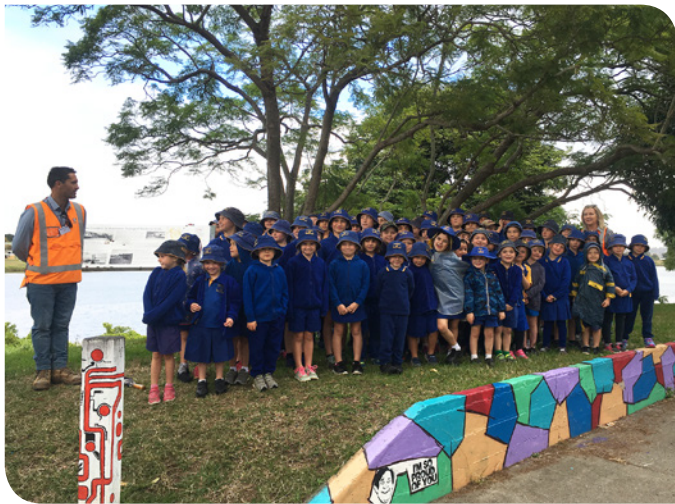
Copmanhurst Public School's entire student population were given a bridge tour in July

If your group is interested in learning more about the project, please contact the Community Hotline to discuss.