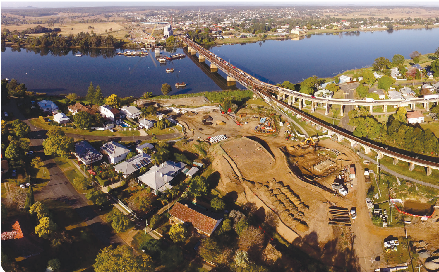
Panoramic view of the new Grafton bridge site (north)