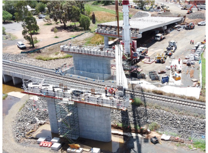
The first girder being placed over the rail corridor during 72 hour rail possession

This was a complex task which took planning and precision to complete within the tight deadline which the team managed to deliver ahead of schedule.