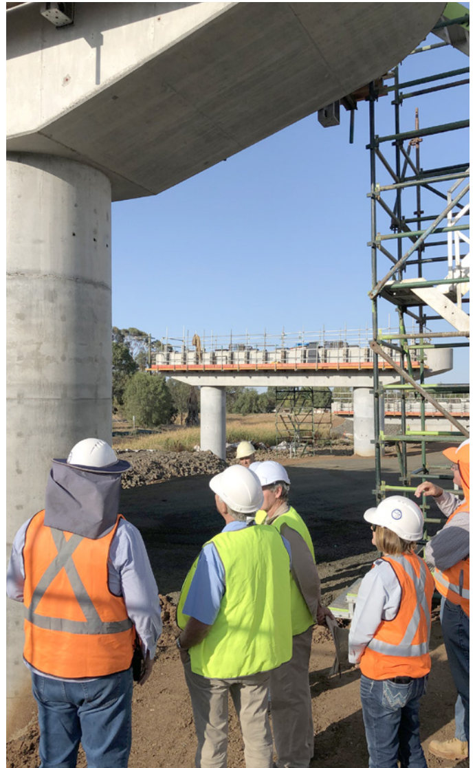
Business focus group site inspection in January 2020

School students who have an interest in engineering have also toured the project to learn more about what goes on with building large structures.