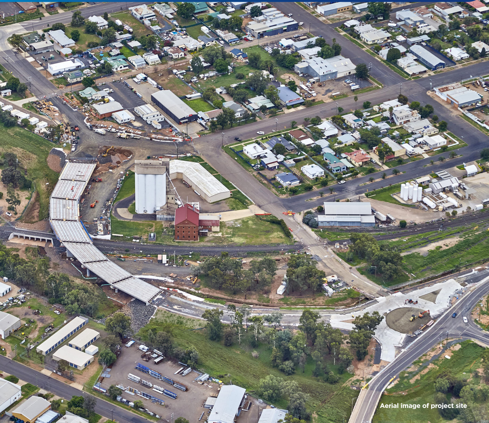
Aerial image of project site