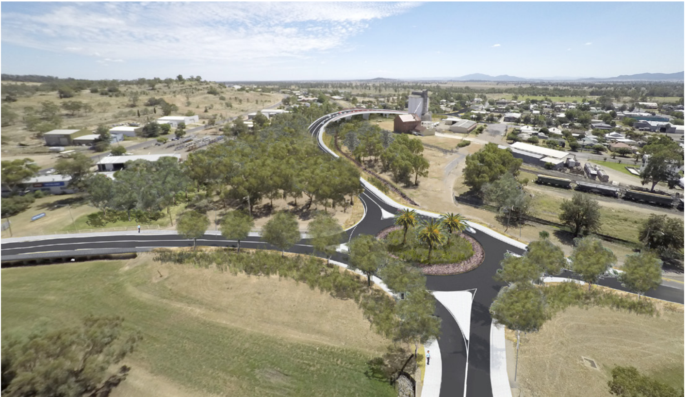
Artist impression of landscaping around the Oxley Highway roundabout area