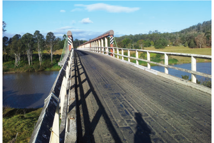
The existing timber truss bridge

We appreciate that the community has been patient during construction works and are excited to see the new bridge opened to traffic. Due to Covid-19 and the uncertainty around gatherings, the project team will not hold a community day for the opening of the bridge but will delay it until the park area is complete and there is more certainty around the evolving Covid-19 situation.