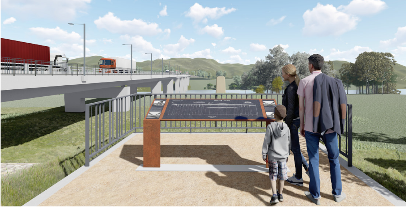
Artists impression of the viewing platform

Elements of the viewing area have been designed to reference the key dimensions of the de Burgh Truss spans of the existing bridge. For example, the overall footprint for the viewing area platform is the same dimensions of a truss span.