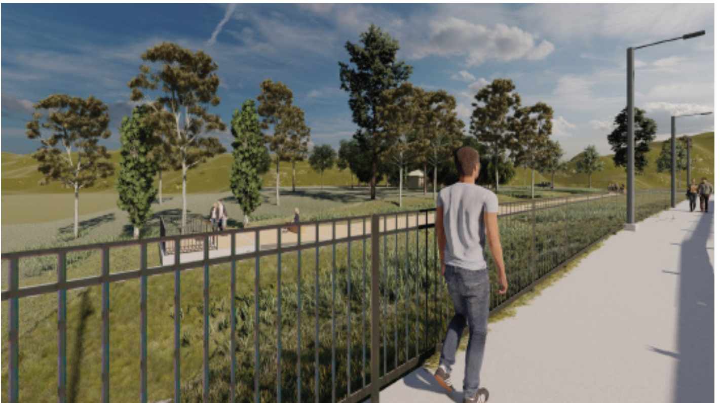
View to the east from the new bridge abutment