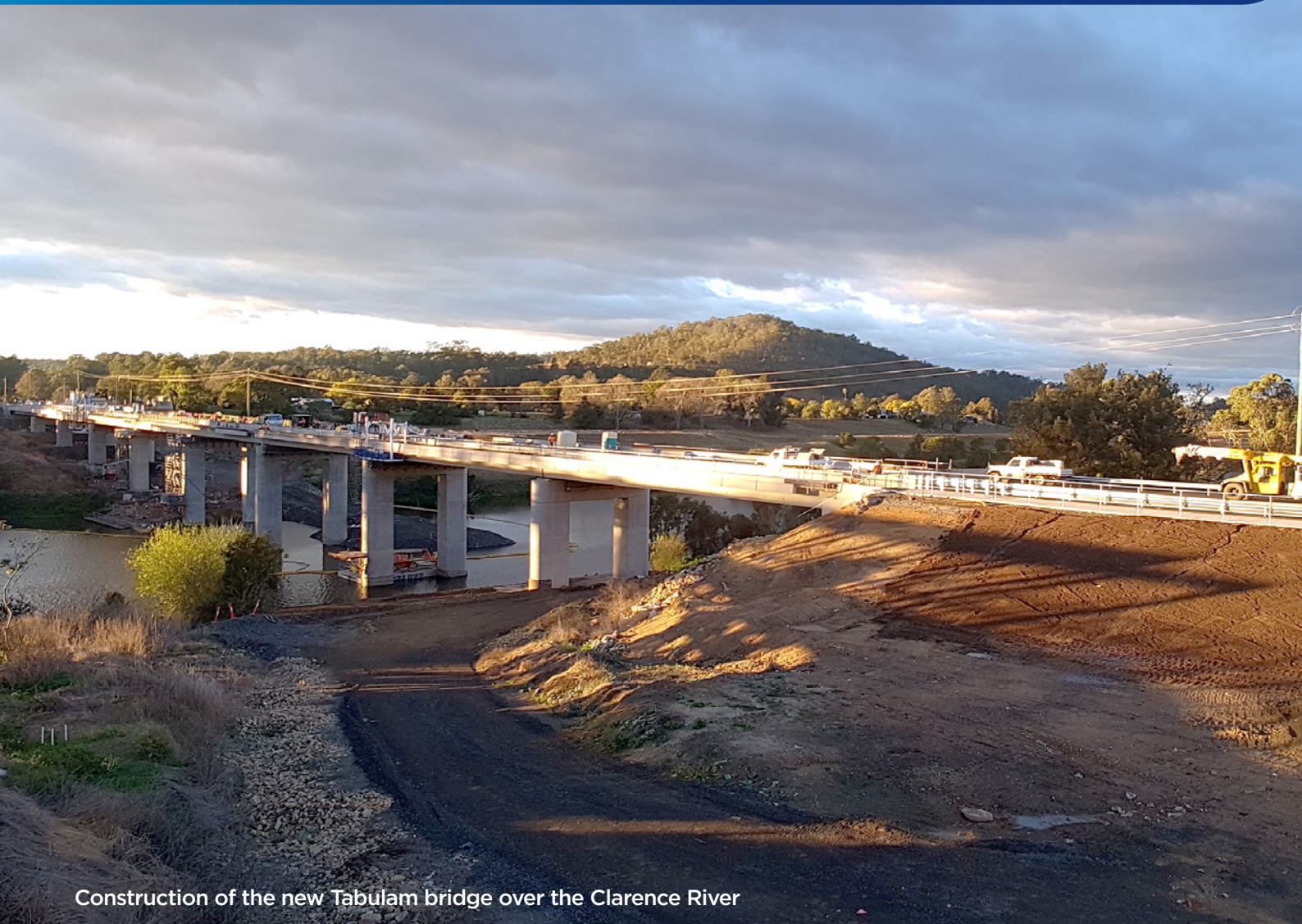
Construction of the new Tabulam bridge over the Clarence River

The new Tabulam bridge is now open to traffic. Despite the challenges over the last year with bush fires, flooding and Covid-19 impacting the project, the bridge is now complete and finishing works will continue over the coming months.