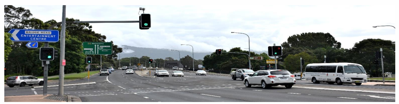
Footpath construction will occur near the Princes Highway and Scenic Drive, Nowra

Work is progressing on the Nowra Bridge project, with construction expected to be complete in mid-2024.