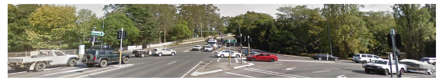
Geotechnical and utility work will take place on the Princes Highway and connecting roads

The NSW and Australian Governments have each committed $155 million to the Nowra Bridge project.