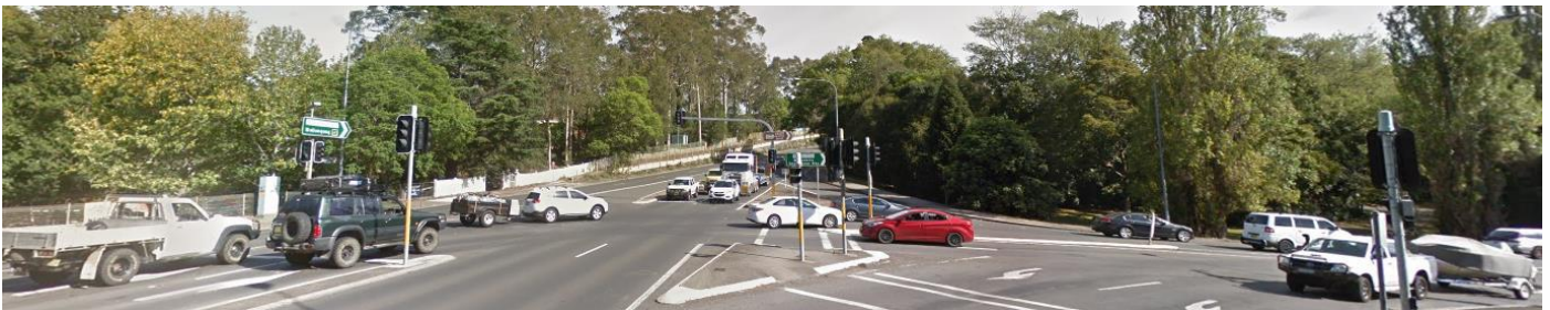
Utility investigations will take place on the Princes Highway and local roads, Nowra

The Australian and NSW Governments are funding a new four-lane bridge over the Shoalhaven River, upgraded intersections and additional lanes on the Princes Highway.