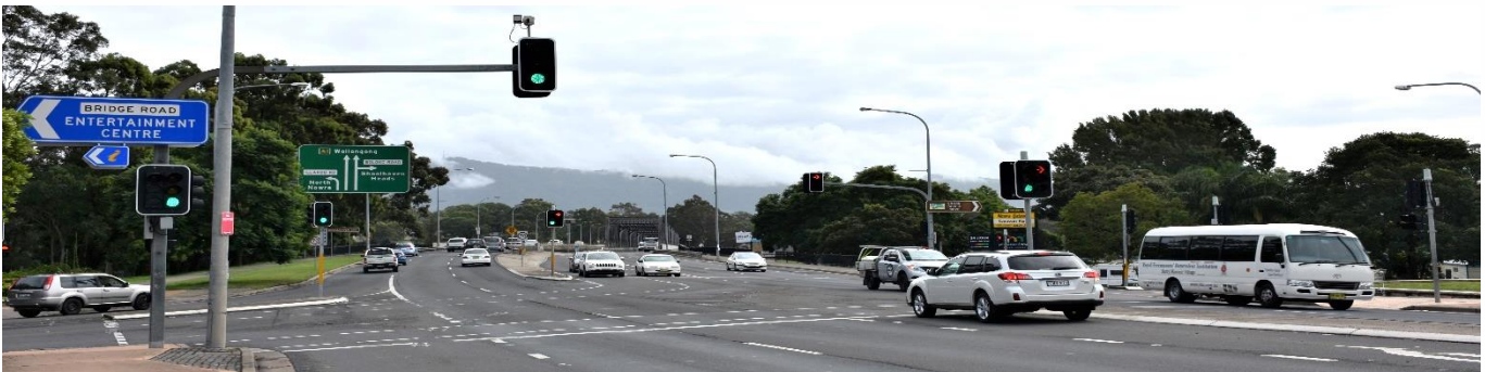
Vegetation removal and service investigations will take place at the eastern end of Scenic Drive, Nowra

The Australian and NSW Governments are funding a new four-lane bridge over the Shoalhaven River, upgrading intersections and building additional lanes on the Princes Highway.