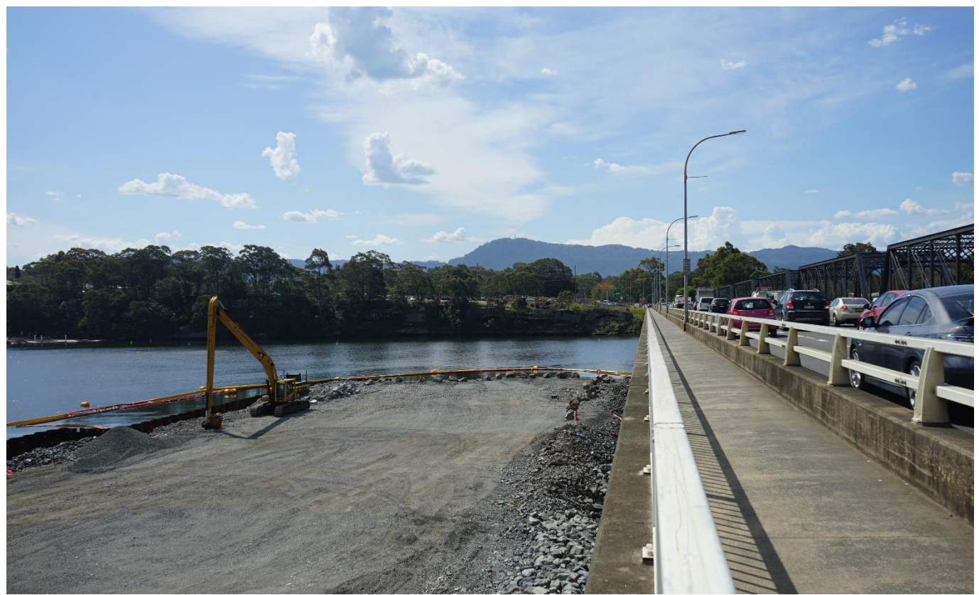
The temporary rock platform from which piling on the southern part of the river will occur

The Nowra Bridge project will provide a new four lane bridge over the Shoalhaven River, upgraded intersections and additional lanes on the Princes Highway.