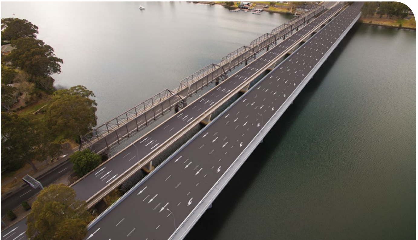
Artist's impression - Perspective of the new four lane bridge over the Shoalhaven River - view from the north west side of the river

Feedback received will be considered to finalise the concept design and prepare environmental assessment for the project.