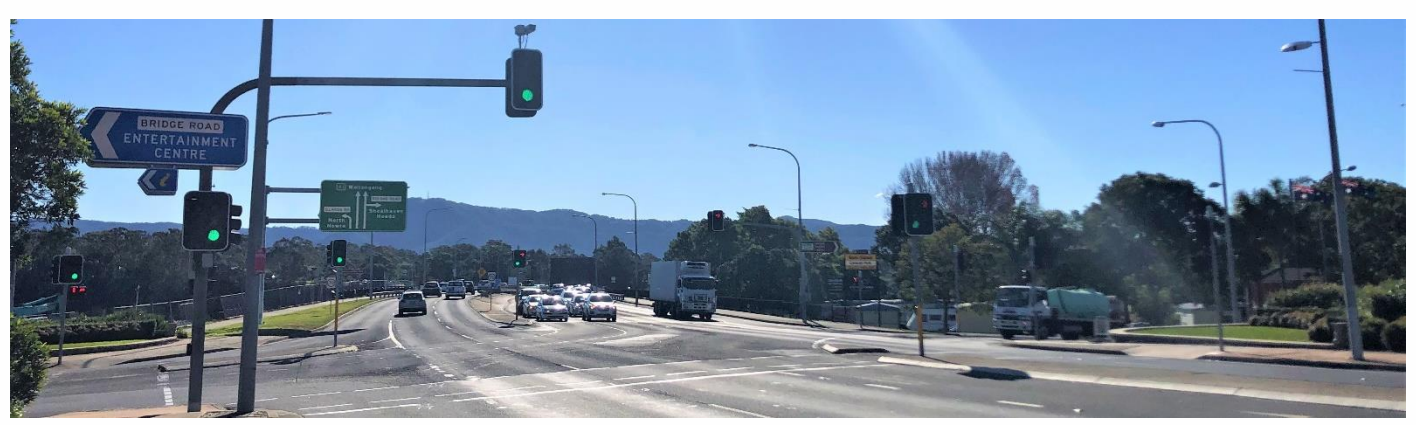
Utility investigations will occur on the Princes Highway and local roads, Nowra

Work is progressing on the Nowra Bridge project, with construction expected to be complete in mid-2024.