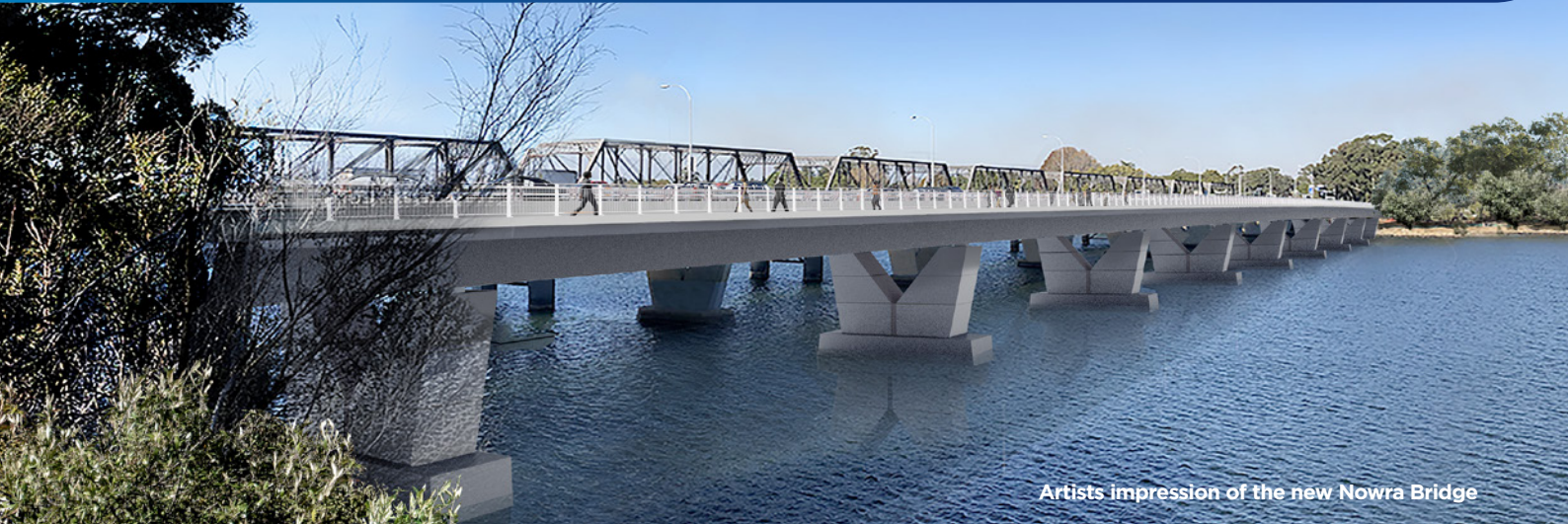
Artists impression of the new Nowra Bridge