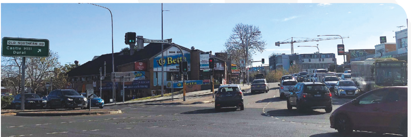
Old Northern Road

We have included a map (overleaf) that shows existing parking, clearway and bus lane restrictions along Old Northern Road and the new clearways and new bus lane hours. Existing parking, clearway and bus lane restrictions will continue to apply outside of the clearway and bus lane hours.