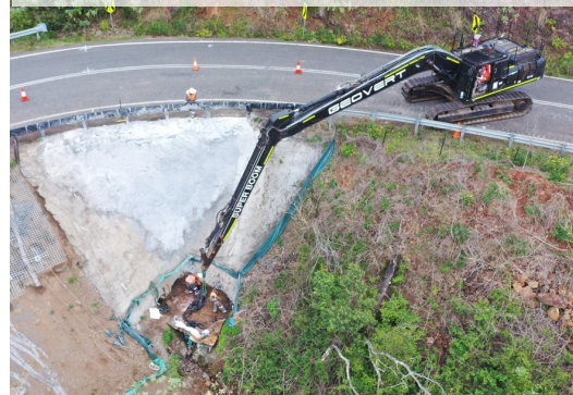
Gabion corner - complete